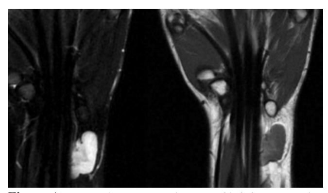
Figure A ) Magnetic resonance images of left forearm-wrist. Left: Coronal T2 weighted fat suppressed image. Lesion is hyperintense. Right: Coronal T1 weighted image. Lesion is hypointense. Lesion has lobulated contour on both images.

After that patient was referred radiology department, magnetic resonance imaging (MRI) was performed. On MRI, left forearm-wrist on the volar side, lesion was localized to the deep subcutaneous fat plane, extended between flexor tendons and was adjacent to the tendons. The lesion was hyperintense on fat suppressed coronal T2 sequence and hypointense on T1 sequence (unlike lipomas), had lobulated contour and 3x2x0,5 cm size (Figure A). After contrast administration on T1 fat suppressed image, lesion enhanced homogeneous (except central small hypointense area which demonstrates fat) (Figure B). Patient was operated. Histopathologic diagnosis was reported as hibernoma.