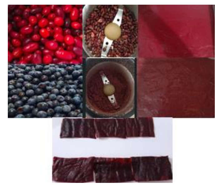
Figure 1. Cornelian cherry and Blackthorn Fruit Leathers

was obtained by grinding in a grinder for 1 min. The seed powder, flour and starch were slowly added to the boiling mixture and continuously stirred. In the second stage, the boiled product was spread on trays to 1 mm thickness and then left to dry in room conditions for 3 days. Later the fruit leather samples were analysed. Six types of fruit leather samples were prepared; CC -wild Cornelian cherry control fruit leather, CGS1 - wild cornelian cherry fruit leather with 1% grape seed powder, CGS2 - wild cornelian cherry fruit leather with 10% grape seed powder, SC - blackthorn control fruit leather, SGS1- blackthorn fruit leather with 1% grape seed powder and SGS2 blackthorn fruit leather with 10% grape seed powder (Figure 1).