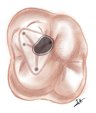
Figure 5: Illustration of caries-driven access cavity on maxillary first molar.

This approach removes all decayed tissues while preserving the healthy tooth structure (Fig. 5). Access to the canals is achieved by eliminating the decayed areas only (Plotino, 2021; Chan et al., 2022).