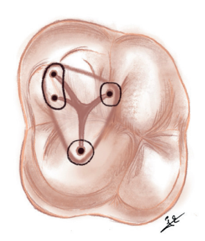
Figure 4: Illustration of truss access cavity on maxillary first molar.

The method is also called an orifice-directed dentine conservation access cavity (Chan et al., 2022). This technique involves creating multiple small cavities to reach the canal openings in teeth with multiple roots while maintaining the dentinal bridge that separates them. For example, three distinct cavities can be created in the molars of the upper jaw (Fig. 4). Likewise, a total of two separate access cavities can be created for mandibular molars, one for the mesial canals and one for the distal canals. Even separate access cavities can be created for each channel.