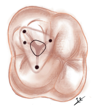
Figure 3: Illustration of ultra-conservative access cavity on maxillary first molar.

Also known as "ninja" access cavities, this method focuses on extreme preservation of the pulp chamber ceiling by creating a highly constricted cavity with sharply convergent walls. The process begins similarly to the conservative approach, creating access through the central fossa, but without further extensions (Fig. 3). In anterior teeth, where the lingual surfaces may exhibit attrition or deep concavities, access is made through the incisal edge parallel to the tooth's axis (Chan et al., 2022; Ingle et al., 2019).