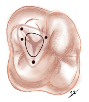
Figure 2: Illustration of conservative access cavity on maxillary first molar.

cavities. In posterior teeth, the access cavity starts at the central fossa of the occlusal surface and extends only as far as is necessary to locate the canal orifices (Ballester et al., 2021). Achieving complete straight-line access is not essential. The cavity walls are prepared to converge towards the occlusal surface, allowing visibility of the pulp chamber and canal orifices while preserving part of the roof (Fig. 2). Alternatively, the walls can be prepared with a divergent design (Shabbir et al., 2021). Clinicians can visualize the chamber area and floor by tilting the mirror. In anterior teeth, a small triangular or oval-shaped access cavity is created, enhancing the possibility of preserving the pulp horns and pericervical dentin, which refers to the tooth structure located 4 mm above and 4 mm below the alveolar bone crest (Chan et al., 2022; Ingle et al., 2019).