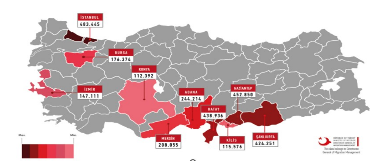
Figure 3. Distribution of Syrians Under Temporary Protection by the Top 10 Cities<sup>15</sup>