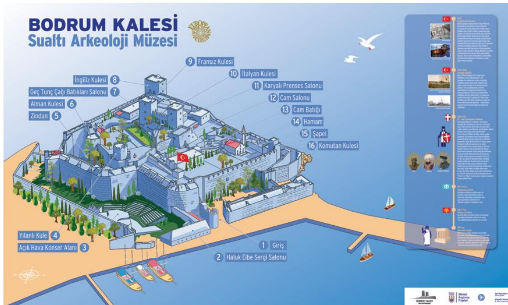
Image 5. "Infographic map of directions" designed for Bodrum Castle, 2016.

As for the second infographic design (Image 5), it was planned to be located at museum's inner-castle door pace, which is the main entrance. It has direction signs charted on the same illustration explaining sections, which first time visitors shall tour. Created vector-based, can be scaled at any proportion.