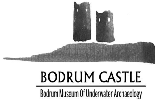
Image 3. Sign and Logo for Bodrum Museum of Underwater Archaeology, 2016.

In this study, there are three different designs consisting of a sign-logo and two infographic maps developed for the Bodrum Castle and the Underwater Archaeology Museum. The reason why the sign-log design is included in the study is to establish a holistic corporate identity. Castle corporate identity catalogue that contains Bodrum Castle's (Underwater Archaeology Museum) logotype, letterhead usage media, infographic presentation and all direction designs, is submitted as a project ready to implement. Castle's visual identity and its infographic map were designed considering its historical development and purpose of current usage.