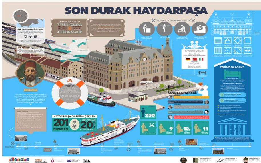
Image 2. Infographic design for İstanbul Haydarpaşa Station, 2017.

activity is required to keep in mind the abstract concepts compared to tangible objects. Therefore cognitively it is more efficient to materialize information in various ways and then to keep in memory. It is, without doubt not a coincidence that many concepts or leadings in almost all cultures dependent on communication technology are expressed by visual symbols alike. These are often graphic symbols called pictograms. Visual patterns comprising infographics are usually pictogram originated ones. This is an efficient way for data communication. It allows too many different numerical data to be located in a small area in an extremely clear and memorable way.