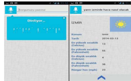
Figure 1: Screen shots of the mobile application: recognizing speech input (left), displaying results for a weather query (right).

In this section we describe the design of our system which comprises a mobile Android client application and a server-side service. The mobile application (Figure 1) is responsible to convey user requests to server and display the service results or perform the requested operation on behalf of the user such as calling a contact person or starting an application. The server processes a user query to understand his/her true intent, then if required delegates the request to the third party web services, and finally, compiles the results and send it back to the client. It is beyond the scope of this paper to discuss the runtime performance of the server-side implementation; though, it is worth mentioning that the query understanding (natural language processing and query classification) takes about half a second on average on a commodity hardware.