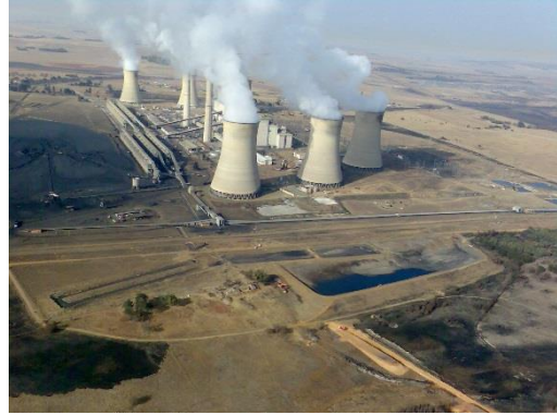
Fig. 2. Sample photos for nuclear power plants [9, 10].