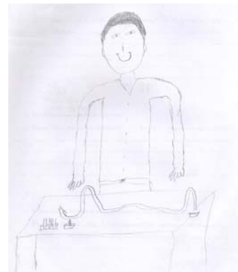
Figure 1b Fifth-Grade Student's (Y12) Drawing