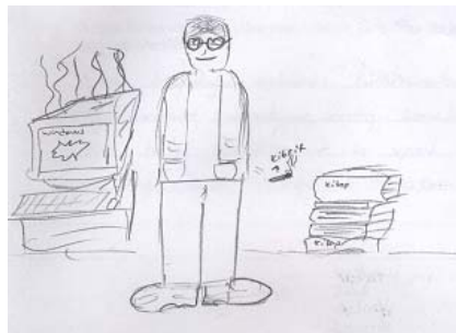
Figure 4 Student Teacher’s (IO7) Drawing

D12- Scientists are working on space...They must be very clever. Scientist always invents new technologies...”