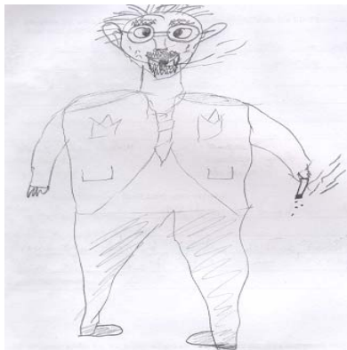
Figure 1a Student Teacher's (BO25) Drawing

Two typical examples of elementary school students' and university level students' drawings for "appearance of scientists" are represented in Figure 1a and Figure 1b. While the student teachers drew a scientist with beard and moustache and a disheveled look, fifth grade students drew a happy scientist with an ordinary appearance.