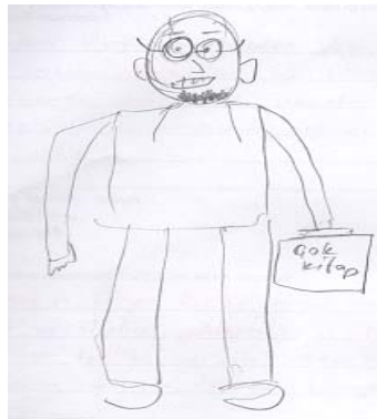
Figure 5 Student Teacher’s (IO9) Drawing

What is more, student IO9’s drawing (see Figure 5) was also consistent with his/her writing. His/her perception of a scientist was stereotypical.