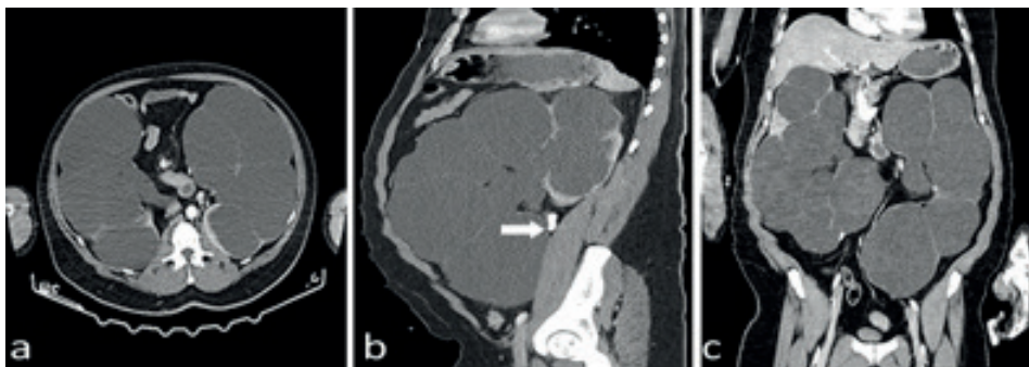
Figure 1 (a-b-c). Axial, sagittal, and coronal contrast-enhanced abdominal CT images. Bilateral giant hydronephrosis, stone in the left proximal ureter (b: white arrow)

In the follow-up abdominal magnetic resonance imaging (MRI) obtained twenty months later, kidney dimensions (Length/AP thickness/Width) were seen to be 12.6x12x7.5 cm on the right and 15x11.7x6.4 cm on the left (Figure-3).