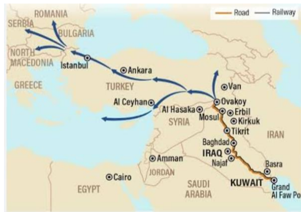
Figure 2. Development Road Project

The Development Road can bring many benefits for Iraq and Türkiye. In this context, the Iraqi government is maintaining its relations with Ankara as it has the opportunity to enter European trade through Türkiye. Through its soft power approach towards Baghdad, Türkiye increases its influence in the region on the one hand, and on the other hand, it has the opportunity to eliminate the elements threatening the Anatolian country. With a solution-oriented reflex that takes into account the mutual risks and benefits, the two states are gradually completing a positive process. While Iraq maintains close contacts with Türkiye due to the importance of the issue, it is also developing a new foreign policy understanding with other European countries, especially Germany. It is clear that this initiative, which will connect the Middle East with Europe, will be a win-win situation for both Europe and the countries in the region. Resolving the political crises in the region is important for the continuation and smooth running of the process. The "Development Road", which covers a larger area than the "Baghdad-Berlin Railway" project planned before the First World War, can bring significant benefits to European countries in meeting their energy needs. In view of the uncertainty of the Russian-Ukrainian war and the crisis with the Russian government, this project is of great importance for Western countries and represents an alternative for covering the energy deficit.