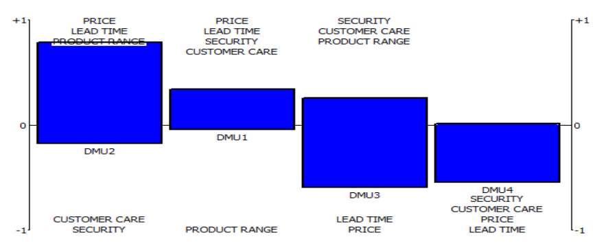
Figure 9. The Best and The Worst Criteria of Online Bookstores

Additionally in Fig. 8 statistics of the evaluation were calculated by software. Minimum and maximum scores, average of them and standard deviations can be seen as above. By specifying the type of min/max, scores can be judge whether it is the best score or not. With the help of these information entered Fig. 9 and 10 was obtained.