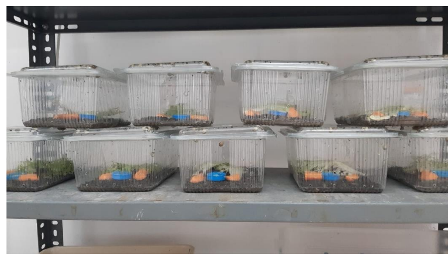
Figure 1. Experimental design (Original) Şekil 1. Deneme dizaynı

The experiment was carried out between December 2021 and February 2022 in the laboratory of Sinop University Faculty of Fisheries. Approximately 1-month-old baby snails with an average weight of 0.16 g, produced in the laboratory, were used in the experiment. A total of 162 baby snails, 18 in each replication, were used for the experiment, which was designed as 3 groups and 3 replications (Figure 1).