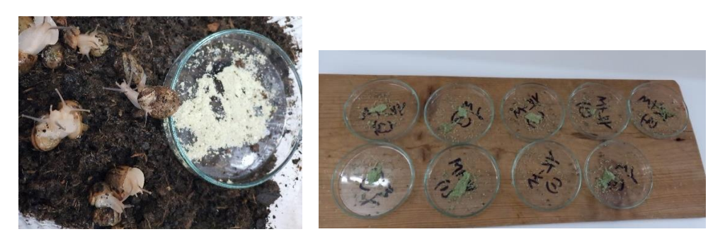
Figure 3. Feeding offspring land snails and removing spent feed Şekil 3. Yavru kara salyangozlarının yemlenmesi ve biten yemlerin alınması

Snails were fed ad libitum with artificial feed in the form of flour prepared according to organic feeding rules (Figure 3). The prepared feeds were weighed daily in certain quantities. Slime wastes contaminating the feed were ignored in FCR calculations. Lettuce, green apple, carrot or cucumber were given alternately with the feed once a week.