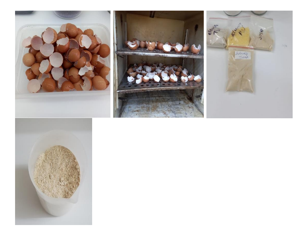
Figure 2. Preparation of experimental diets Şekil 2. Deneme yemlerinin hazırlanması

Snails were fed ad libitum with artificial feed in the form of flour prepared according to organic feeding rules (Figure 3). The prepared feeds were weighed daily in certain quantities. Slime wastes contaminating the feed were ignored in FCR calculations. Lettuce, green apple, carrot or cucumber were given alternately with the feed once a week.