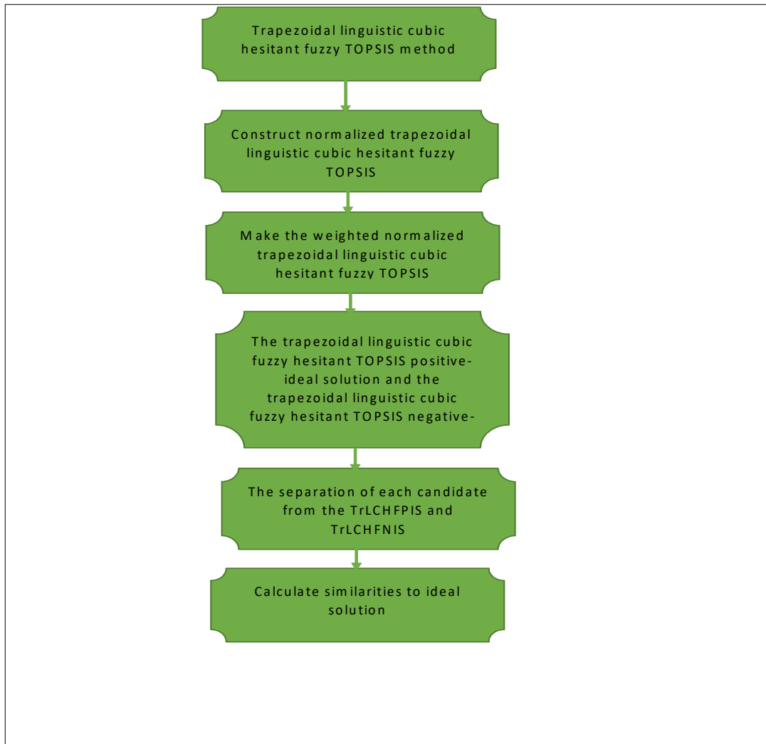
Flow chart of the extended trapezoidal linguistic cubic hesitant fuzzy TOPSIS method