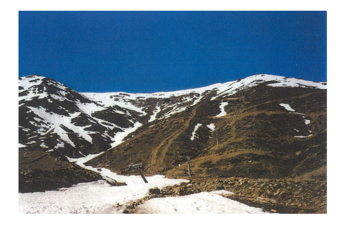
Figure 4. Condition of Skilift Poles After Avalanche Incident in Bozdağ (2015)