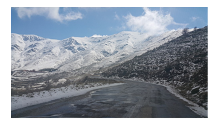
Figure 1. Bozdağ Ski Resort in Winter Season (2016)

Bozdağ Ski Resort is surrounded by Bozdağ (summit 2156 m asl), Catalsivritepe (2138 m), Tozlutepe in the south, Aktaş Peak (2024 m), Kartal Peak (2040 m) in the east, Üçler Peak (1908 m) Ortadağ Peak (1641 m), Çavdar Peak, Sarıpınarlar Peak (1695 m) and Dorukkayaları site (1888 m) in the north. Slopes with the highest gradient in this region are the north-facing slopes of southern and eastern peaks. Especially at Bozdağ and Çatalsivri Peaks at which ski lift are established the maximum, minimum and average slopes overlooking ski resort are usually 55, 26 and 40 respectively. Dominating vegetation cover over the region includes very sparse foliage shrubs and herbaceous plants. Sparse pine forest are present at altitudes lower than 1600 m (asl) and as getting lower altitudes maquis shrub type cover the area. General view of the study area and avalanche paths is shown in Figure 1 and Figure 2.