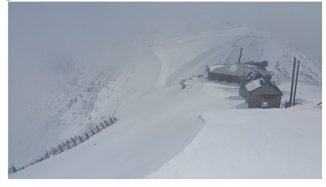
Figure 3. Avalanche Release Zone and cornices in Bozdağ summit in 2016 winter

Examples of damages as a result of avalanche incidents observed during field studies are given in Figure 5 and Figure 6. Figure 5 shows that although the pole has a small crosssectional area and made up of steel, the pole was twisted and fully bent starting from the ground level in the direction of avalanche. Wooden snow bridges used as snow supporting structures were partly damaged at the release zone as seen in Figure 6.