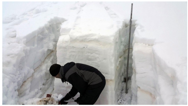
Figure 9. Snow Pit on Bozdağ North Face and Simple Snow Stability Tests (Dr. E. Tekin-2015)

various snow layers formed in the snow pack during winter season and determine the weak layer(s) among others. Detailed study about this procedure given in Figure 9 was presented at 8<sup>th</sup> Engineering and Technology Symposium held at Çankaya University [13].