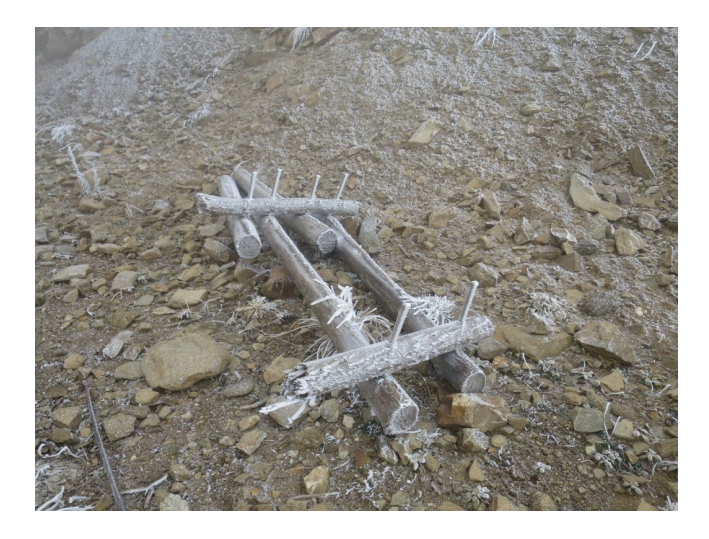
Figure 7. Damaged and Fallen Parts of Wooden Snow Supporting Structures (2014)

structures can be figured out from Figure 7.