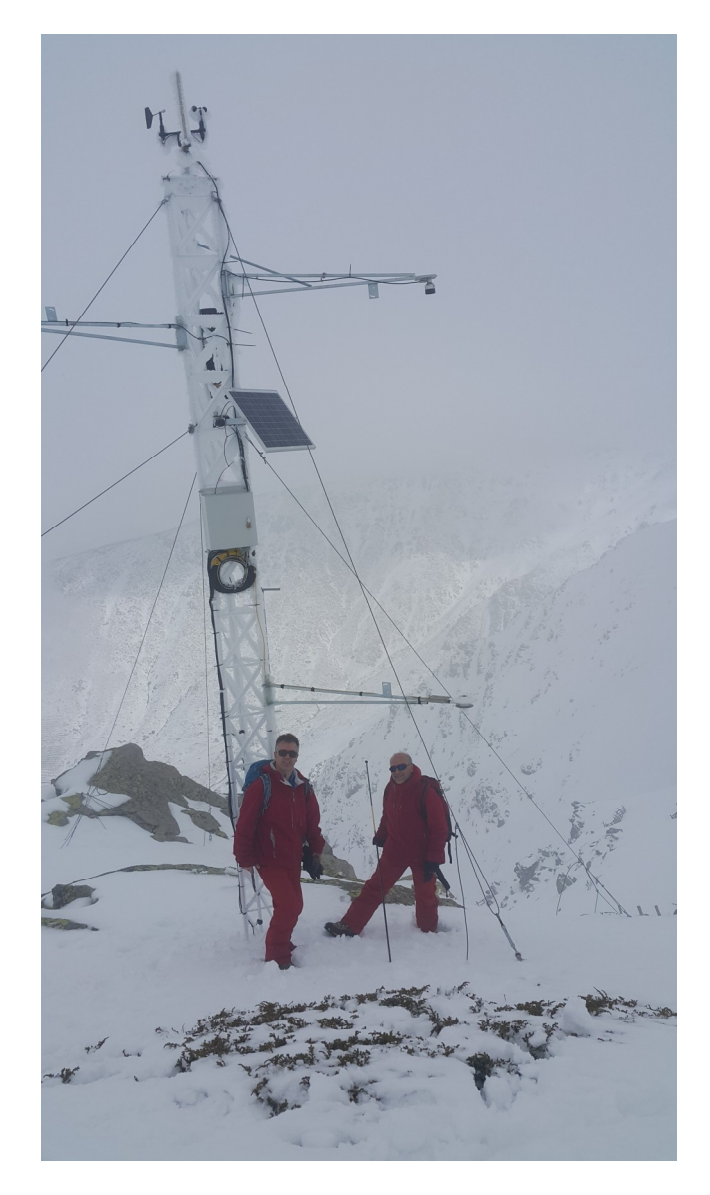
Figure 10. Automated Weather Station For Avalanche Studies on Bozdağ Summit (Ö. Koçyiğit and G. Arslan-2016)

Another objective of the project is to simulate the avalanche incidence happened in the region using numerical modeling. Hence, studies on RAMMS, a numerical model developed by SLF has started with preliminary test simulations.