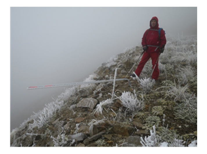
Figure 5. Snow Poles Condition After Avalanche (2014) Dr. Ö. Koçyiğit