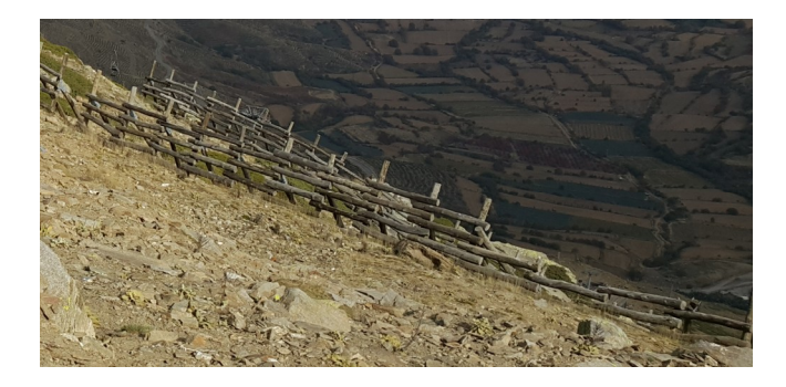
Figure 6. Wooden Snow Bridges and Their Condition After Avalanche (2015) –G. Arslan

Snow supporting structures manufactured from wood and located at upper altitudes of avalanche release zone to prevent avalanche were damaged by the avalanche itself because of some design deficiencies such as insufficient height and some of those damaged parts of the structures broke of and fallen down the slopes. The enormous avalanche pressure exerted on the wooden snow supporting