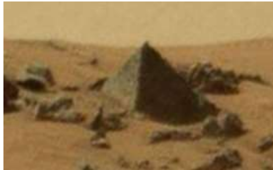
Figure 11. According to the newspaper's claim, that Pyramide photo from Mars