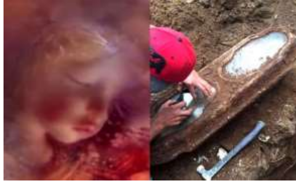
Figure 5. The photo on the left is irrelevant image about the subject. The photo on the right is body of death baby

Headline: It survived in a coffin for 100 years! The secret revealed.