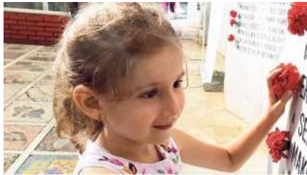
Figure 7. Child aggrieved from earthquake

Headline: a 7.2-magnitude earthquake will happen