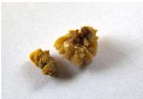
Figure 1. According to newspaper's claim kidneystone which passed by some vegetables

Headline: Interesting Method to Pass a Kidney Stone (Gallery News of 5 Pages).