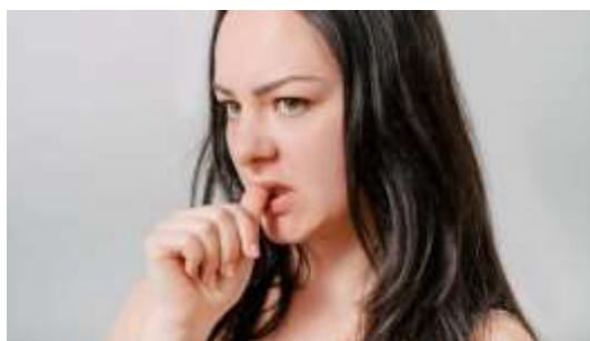
Figure 2. According to the newspaper's claim, biting nails is useful for health

Analysis: "Biting nails" is a multifaceted medical issue that may also be related both to psychiatric problems and microbe-derived physical illnesses. It is mentioned in the headline of the news item that this behaviour has "benefits", with a contradictory and "misleading" expression for readers. When the content of the news item is reviewed, it is seen that the statement "a study published in the