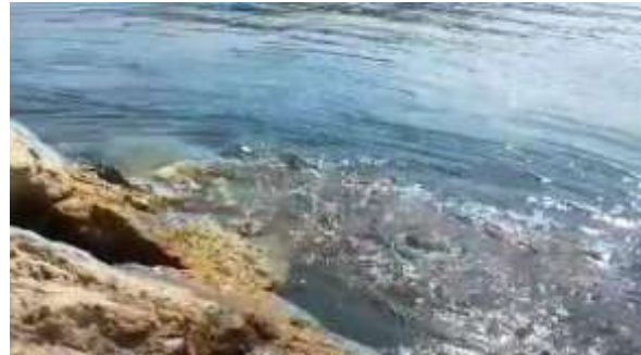
Figure 6. Some abnormalities in the sea after earthquake