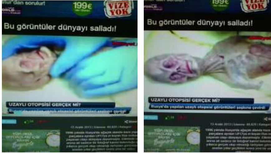
Figure 10. According to the newspaper's claim, these images about alien autopsy

Headline: These Images Shook the World (Video News)