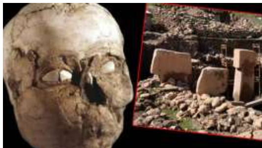
Figure 4. Archaeological provenances from Göbeklitepe

Headline: Breaking News: This could be the first-ever! It was found in Şanlıurfa, its secret revealed.