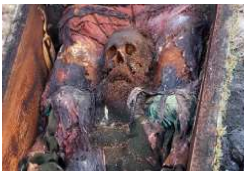
Figure 3. Russian General's body

Headline: Mysterious Events in the Neighborhood Where Russian General was Found.