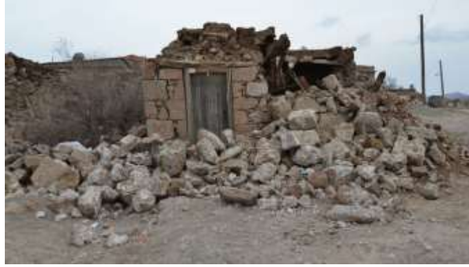
Figure 8. Ruin house from earthquake

Analysis: When the content of the news item is reviewed, it is found out that Prof. HalukÖzener, director of Boğaziçi University - The Kandilli Observatory and Earthquake Research Institute, expresses 5/5.5-magnitude earthquakes occurred in Çanakkalein the recent days can be regarded as normal, there is no abnormality as well as answers the question "Are these small earthquakes a sign for a bigger earthquake in the Aegean Region" with the statement "It is not possible to say anything like that". However, the headline of the news item is presented with a speculative and tabloidized discourse, as if the date and the magnitude of the next earthquake were certain. The image used in the news item is a photograph describing a house that appears to be completely ruined and devastated. It is unclear on which date and where the earthquake that led to the devastation of the house in the image occurred. It is even unclear whether the image is associated with an earthquake. The only thing that is clear is that the image used supports the psychology of fear and the negative effects created by the headline "Big Earthquake".