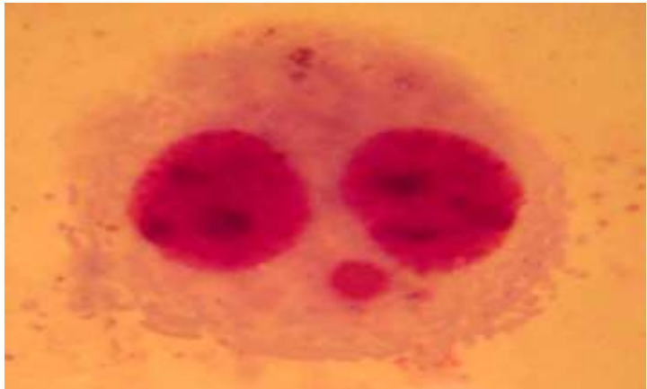
Figure 1. Cytokinesis-blocked two-nucleated lymphocyte cells and micronucleus (Özdemir et al., 2012)

As a result of the increased exposure of humans to food additives in today's conditions, assessing genotoxicity of food additives, which their genetic effects have not been fully under control yet, is of great importance for human health. Although all the research and inventions on the technical field are conducted in order to provide a healthier life and better nutrition, they are accompanied by countless problems. Despite being used in allowed quantities, food additives are taken almost daily through food and hence accumulated in the body over time due to the very long exposure. This accumulation leads to toxic effects in the body, resulting in various damages. These damages cause genotoxic effects when occurred on the genetic material. Short-term genotoxicity test systems are used to determine whether a chemical substance is genotoxic (Arslan, 2004; Yılmaz, 2008; Mpountoukasetal, 2008; Çelik, 2003; Parlak, 2007; Yüzbaşıoğlu et al., 2006). Many studies have been carried out to investigate the genotoxic effects of food additives to date. Ozdemir et al. (2012) investigated the genotoxic effects of Potassium Sorbate (200-500-1000µg/ml), Sodium Benzoate (100-300-800µg/ml) and Sodium Nitrite (1-10-100µg/ml) using micronucleus test technique in human lymphocyte cell culture. It has been put forth that potassium sorbate and sodium benzoate showed no genotoxic effect at concentrations used in food, but all concentrations of sodium nitrite were found to be genotoxic (Figure 1).