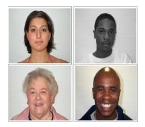
Figure 3. Examples from UTD database

Figure 1. Examples from Grey ScaleFigure 2. Examples from ColorImages of FERET databaseFERET database