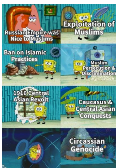
Image 4. Isis actually released a statement condemning H