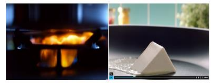
Figure 4. Fire, Butter and Smoke

Scenes such as the fire burning, butter melting and smoke billowing support the mythic narratives in the advertisement. These scenes are used as incentives for the consumer to take action. For example, the burning fire and melting butter create a sense of energy and transformation in the viewer (Eliade, 2001, p.33).