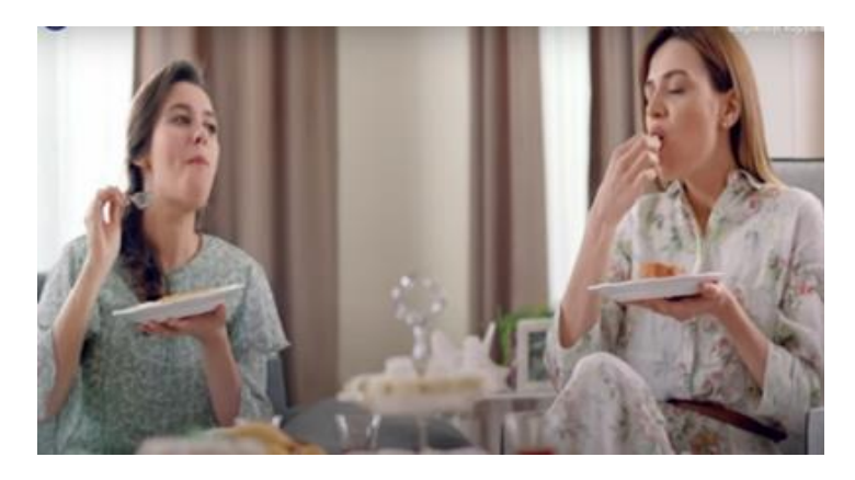
Figure 7. Tasting the Food