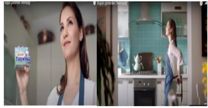
Figure 2. Woman Showing Teremyağ

The woman ties her blue kitchen apron and shows Teremyağ in her hand. In the kitchen, there are details such as a porcelain teapot and a salad board. The external voice motivates the woman by saying "today is your day!". In this scene, it is seen that the advertisement conveys a personal message to the consumer and deals with the themes of individual success and self-confidence (Ross, 1990).