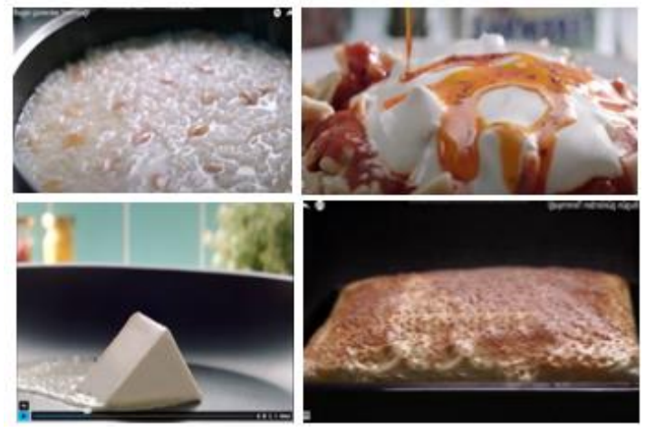
Figure 3. Preparation in the Kitchen