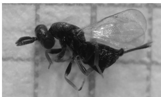
Figure 1. Adult of Bruchophagus roddi

The present results supported those obtained by Soroka and Spurr (1998), who referred that winter hardy cultivars becoming dormant early in the Autumn season had lower levels of the chalcid-damaged seeds (Figure 3) compared with less hardy cultivars maintaining growth later in the season. In the earlier study, it was reported by Peterson et al. (1991) that high variability was observed in the damage owing to trefoil seed chalcids between years. Previously, De Barro (2001) has mentioned that alfalfa seed chalcids led to the economically significant losses. Further studies on the loss of the chalcids and the effective factors on the loss should be conducted under various conditions due to economic causes.