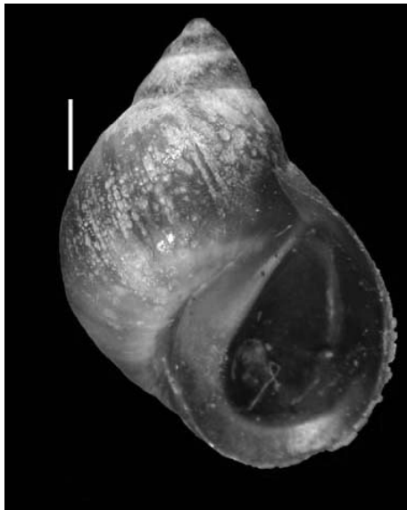
Figure 2. Melarhappe neritoides (Linnaeus, 1758)

In this study, length of the largest specimen is 9 x 6 mm (see Fig. 2). The shell may be 3 to 9 mm high [24]. Sometimes, the size of the shell may be up to 9 x 7 mm [20] and 10 x 8 mm [10].