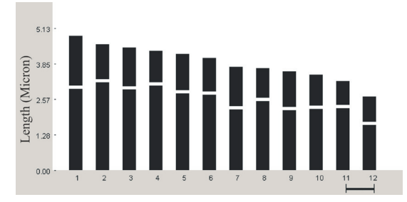
Figure 2. Idiogram of Silene behen (2n = 24) Scale bar: 10 µm.

The idiogram of this species has been prepared as a result of the study (Figure 2).