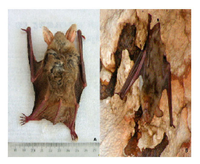
Fig. 1. Two sibling species Myotis myotis (A) and Myotis blythii (B)

Although taxomic, karyologic or biologic studies of two taxa were achieved from Turkey [4-7] no studies have been achieved on the SDS-PAGE patterns of blood serum proteins.