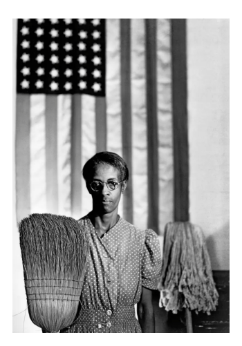
Image 1. Gordon Parks, American Gothic, 1942, Photography, The Gordon Parks Foundation, Washington D.C.