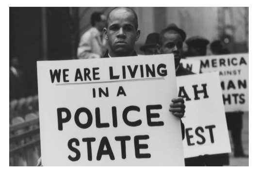
Image 6. Gordon Parks, Untitled, 1963, Photography, The Gordon Parks Foundation,