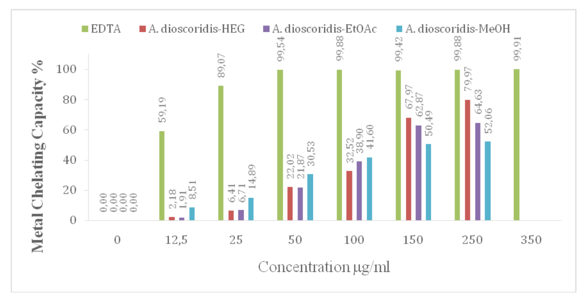
Figure 2. Metal chelating capacity of different solvent extract of Acanthus dioscoridis var. dioscoridis as compared to standard EDTA. The values are the mean for set of tree values.

The chelating capacity of HEG extract was found concentration-dependent. Linear increasing in the metal chelating capacity was observed with increase in concentration of extract. Metal chelating capacities of MeOH and EtOAc were found close to each other.