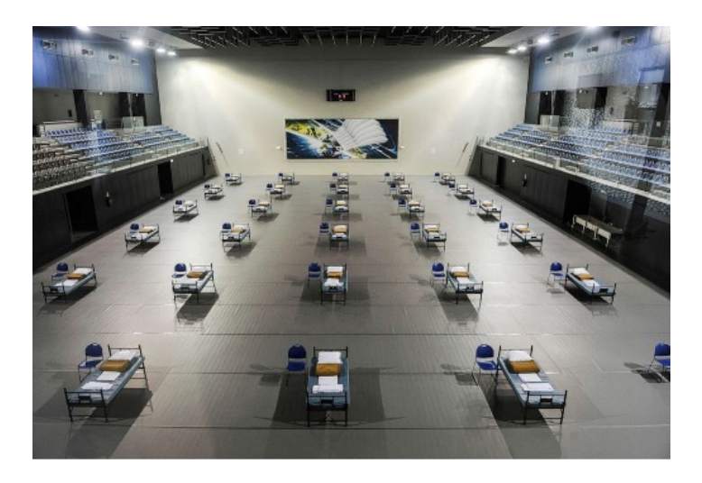
Figure 6. A Temporary Hospital in COVID-19

Another significant ad hoc response to the pandemic was the use of technology. Telemedicine experienced a sharp adoption growth in the wake of fear of face-to-face interaction since both the patients and physicians wanted to minimize their exposure to the virus (Greer et al., 2023). This change ensured that all patients received advice and continued care when lockdowns were in place, and hospitals were overburdened (World Health Organization, 2021). Educational facilities and businesses made these adjustments in only a few days, and many started using online tools and platforms to help with their operations and to continue their education (White et al., 2020).