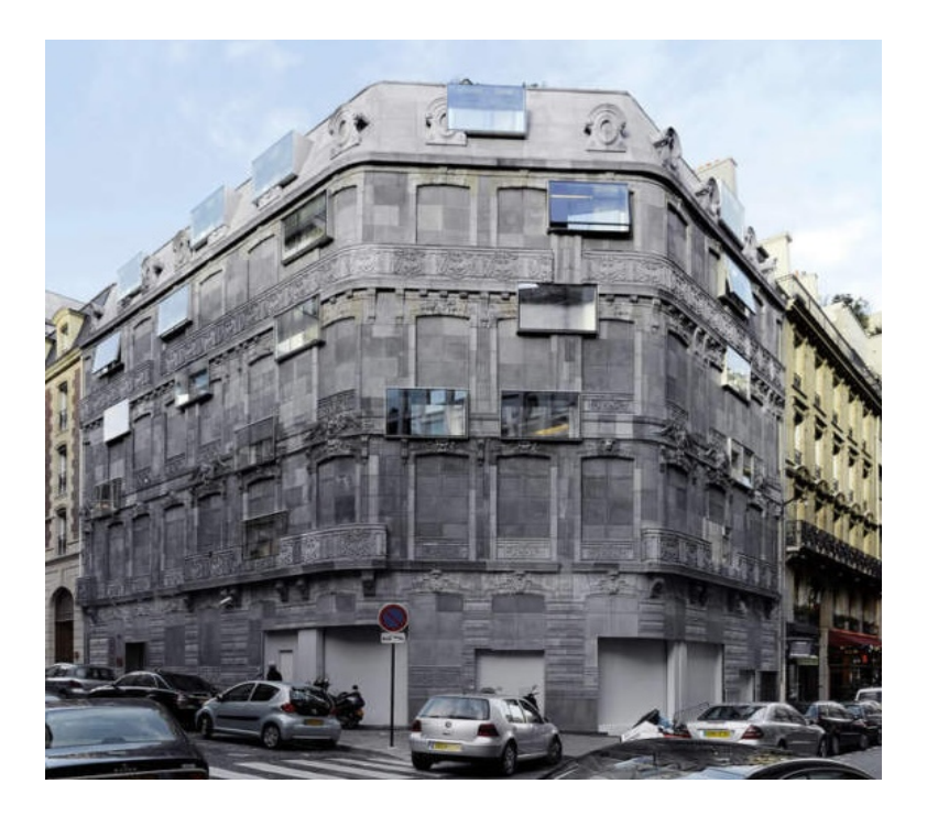
Figure 3. Mandated Repro-Style and the Modern Windows by Edouard François

Moreover, adhocracy brings about a cultural transformation that stems from prevailing non-bureaucratic traditional attributes. Proper conduits of communication and feedback machines will be key pillars of consistency within adhocratic teams' systems of operation (Sood and Rawat, 2021). For this, the figure by Edouard François in Paris can be taken into consideration, focused on mandated repro-style and modern windows.