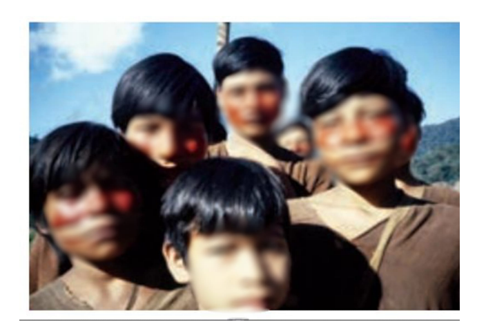
Figure 2. Amazon Basin Decorated Faces Source: Jencks and Silver, 2013.

hand. Any sensible man would prefer a piece of corrugated board to a thatch roof unless he got rich and could afford to be romantic (Object Guerilla, 2013, December 15)." The figure below highlights Singular adhocism in the Amazon Basin: decorated faces expressing custom and tribal membership, a photograph by Nathan Silver: