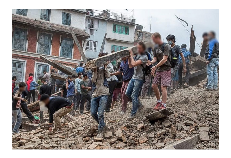
Figure 5. Nepal After the Earthquake

faced. The NPC undertook an intensive holistic exercise in which important stakeholders were involved. This was meant to assess the extent of damage and loss and address the needs of those affected. The PDNA report painted a complete picture of the magnitude of destruction and prioritized the rebuilding and resettlement program (Government of Nepal National Planning Commission, 2015).