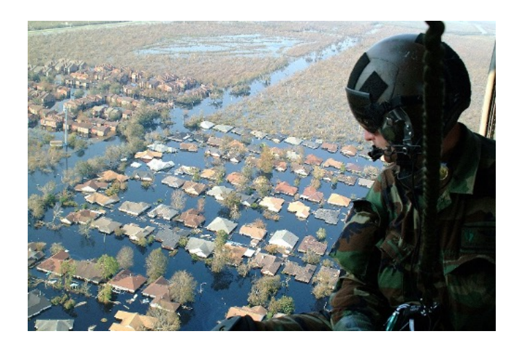
Figure 4. Hurricane Katrina Aftermath

proved inadequate for handling Katrina's impact. State and federal responders were slower to arrive due to their distance from the disaster site. Historically, FEMA played a larger role in pre-event planning and post-event recovery than in managing disasters in progress. This lack of agility hindered the response to Katrina (FEMA, 2005). Local communities quickly organized themselves to set up impromptu relief centers and distribution points for essential supplies such as food and water (Huang, 2014). Buildings like the New Orleans Superdome were repurposed into emergency shelters, although they were not initially designed for such use. Additionally, residents employed private boats and vehicles to rescue stranded neighbors, filling the gap left by insufficient government-organized evacuation efforts (Golden, 2013)