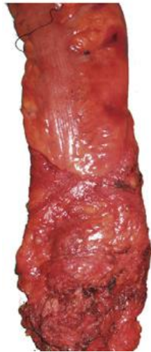
A. Cylindrical (ELAPE) specimen