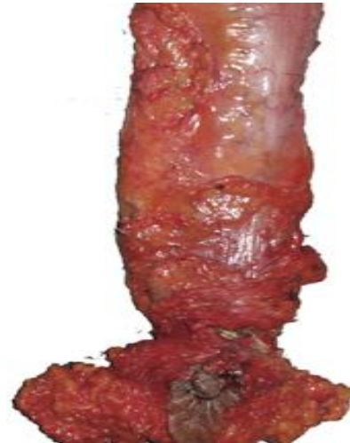
B. Conventional APE specimen