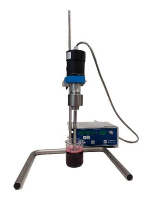
Figure 3. Ultrasonic probe