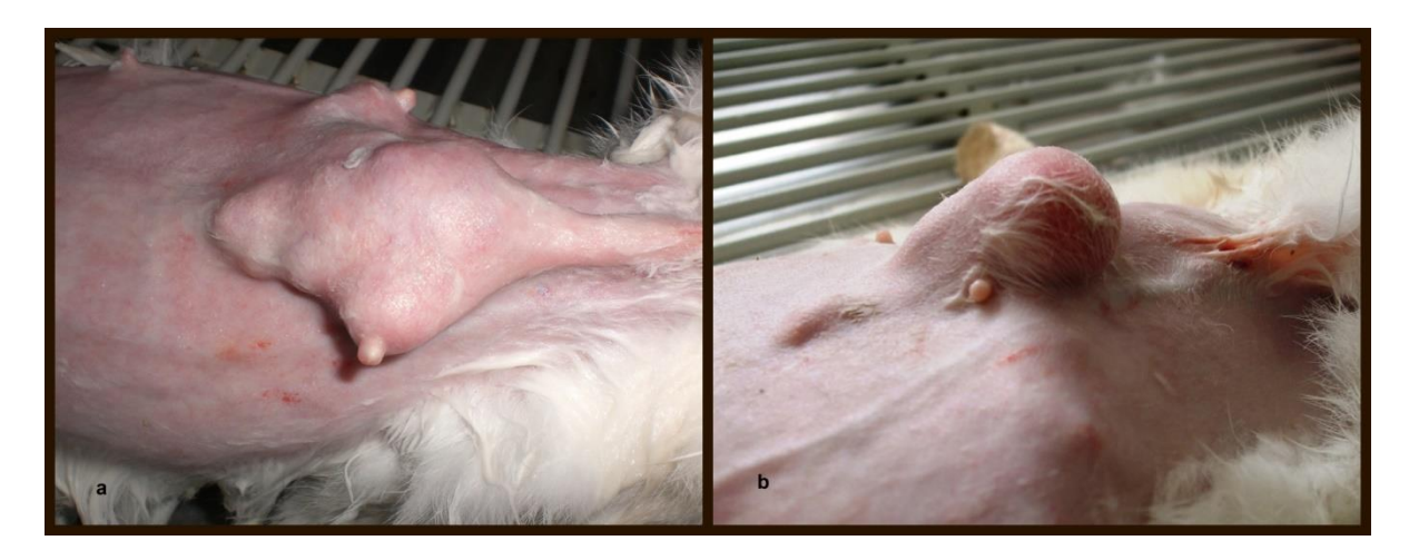
Figure 1: Clinical view of the tumour a: start of the treatment, b: before the surgery Sekil 1: Tümörün klinik görünümü a: tedavi başlangıcı, b: operasyon öncesi

Before every administrations size of the tumour was measured and evaluated with ultrasonography (ESAOTE Pie Medical, 100 Falco, 6-8 Mhz Linear transducer). By the time reduction in the size of the tumour and healing of mastitis were observed. At the start of the treatment size of the tumour was 4.1x5.1 cm, in the second week 3.04x3.01 cm and at last week before the surgery 2.63x2.12 cm. (Figure 1, 2). One week after the last Tarantula cubensis extract administration unilateral performed mastectomy was under general anaesthesia (Xylazine, 5 mg/kg, im, Alfazyne, Ege-Vet, Türkiye + Ketamine, 35 mg/kg, im, Ketasol, İnterhas, Türkiye). Tissue samples were fixed in 10% formaldehyde for routine histopathological processing. Fixed tissue samples were stained with haematoxylin and eosin (H&E) and Mallory's triple staining to show histopathology and examined under a light microscope.