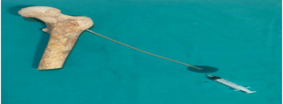
Figure 3. Retrograde Platelet rich plasma (PRP) leakage that occurs after Platelet rich plasma (PRP) application if not enough fluid is sent into the Nelaton catheter (2cc).

F-Platelet rich plasma application, isotonic fluid is sent through the Nelaton catheter to fill the internal volume of the catheter (2 cc) to prevent retrograde flow of platelet rich plasma and deliver it to the avascular necrosis area with full efficiency.