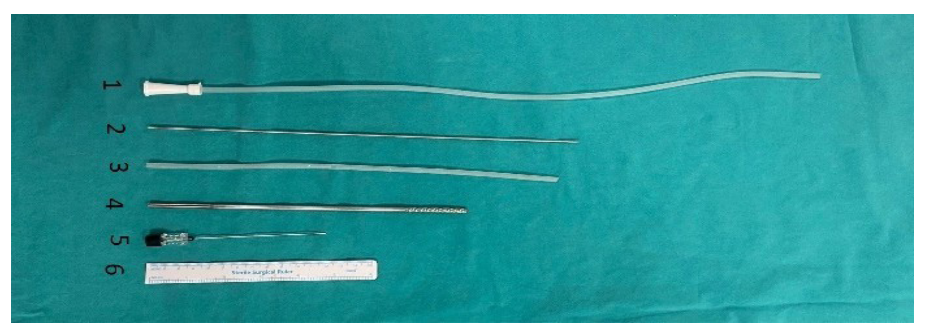
Figure 1. 4mm (12 Ch) x 50cm nelaton catheter ,1.8mm x 30cm kirscher wire ,12-ch nelaton catheter , length matched to the K-wire, 4 mm drill, spinal needle used in other studies, length gauge, note that the length of the spinal needle is shorter than the nelaton catheter.