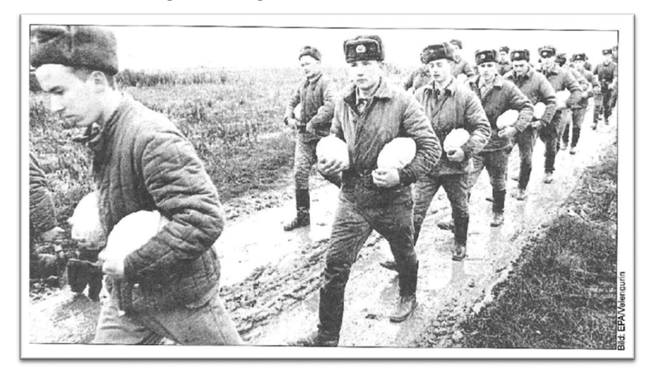
Source: Egbert Apfelknab, Weltpolitische Entwicklungen. Eine Bestandsaufnahme über globale und regionale Konfliktszenarien aus wehrpolitischer Sicht , Eine Information des BMLV Büro für Wehrpolitik, April 1997, Wien, p. 13.

Exhibit-2: Cabbage as a Wage for Russian Soldiers.