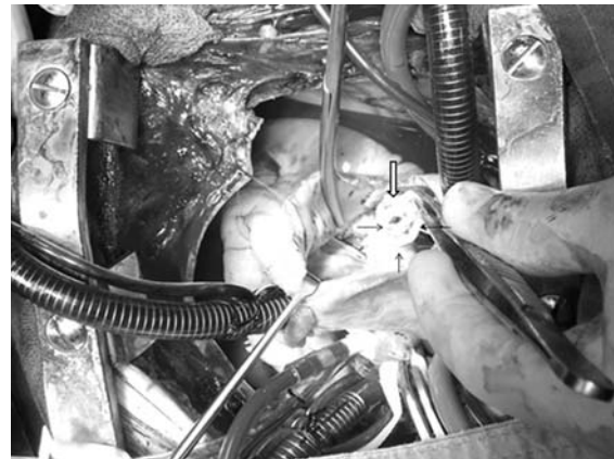
Figure 2 . Resection of ruptured aneurysm sac after right atriotomy. Thin arrows indicates (→) deformed right atrium wall, wide arrow indicates (⇨) SVA sac.

After sternotomy, standard cardiopulmonary bypass and moderate hypothermia with bicaval venous cannulation was performed. After cross clamping, antegrade blood cardioplegia was given for myocardial protection. Right atriotomy was performed with an oblique incision starting from 2 cm under the superior vena cava cannula under cardioplegic arrest. Smooth and thin walled aneurysm sac attached to the right atrial roof was seen (Figure 2). Aneurysm sac was resected. Tissue around the sac appeared to be very loose. After removing the sac, 0.5x0.5 cm defect was repaired with a 1x1 cm Dacron patch (Figure 3). Sutures were carefully assessed to avoid any injury to the aortic valve. Atriotomy was closed primarily. Cardiopulmonary bypass was terminated without any complication. In the postoperative period fast recovery of the patient was observed. The patient was discharged on postoperative day 7. Three months after surgery TTE follow up was performed and no defective sign except right atrial dilatation was seen. The patient was graded as NYHA Class-I.