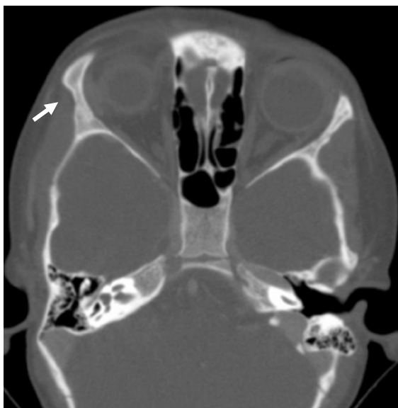
Figure 3. Control CT image shows the intact lateral orbital wall and sclerosis of the healed bone (arrow).