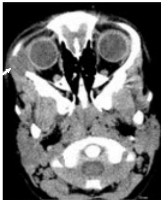
Figure 2. Axial computed tomography image demonstrates a hypodens rounded shaped soft tissue lesion at the lateral wall of the right orbit with bone destruction ( arrow )

negative for S100 and CD1a. For orbital cellulites he was treated with intravenous ceftriaxone (75 mg/kg/day) and teicoplanin (10 mg/kg/day) for ten days, but no regression was observed. In relation with the histopathologic result and non-responsiveness to antibiotherapy, it was thought as orbital pseudotumor and the child was treated with oral prednisolone (2 mg/kg/day). A few days later, his pain was decreased and one week after the treatment started, a significant resolution of swelling was observed. For two weeks, he had taken full dose of oral prednisolone treatment and the dose was tapered gradually. He took total four weeks of corticosteroid treatment.