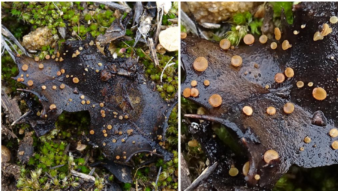
Figure 1. Ascocarps of Rutstroemia coracina on dead leaves of Quercus coccifera .

Rutstroemia coracina is added as a new record for Turkish Mycobiota. It is the fourth member of the genus Rutstroemia in Türkiye. General characteristics of the Turkish collection are in agreement with Dennis (1963), Spooner (1981), Galan et al. (2013), and Garcia et al. (2020).