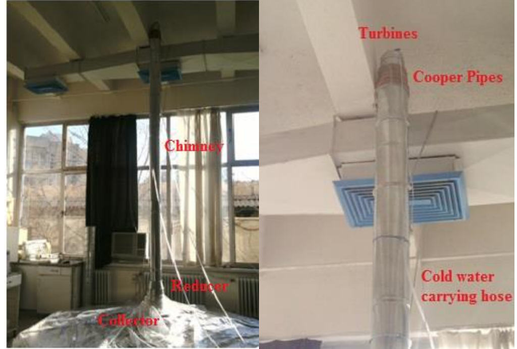
Figure 1. An experimental setup