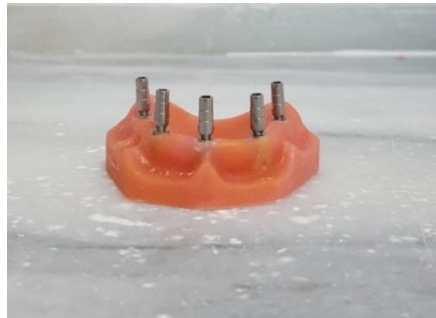
Figure 1. Master model and fastened impression copings

The edentulous maxilla model and custom impression trays were fabricated from auto-polymerizing acrylic resin for this in-vitro study. 5 implant analogs (Moment Dental Implant Systems, Turkey) representing implants were placed in the midline on the edentulous maxilla model, on both sides canine and first molar region. The conical impression copings were fastened to the analogs and torqued at 12 N/cm for standardization (Fig 1).