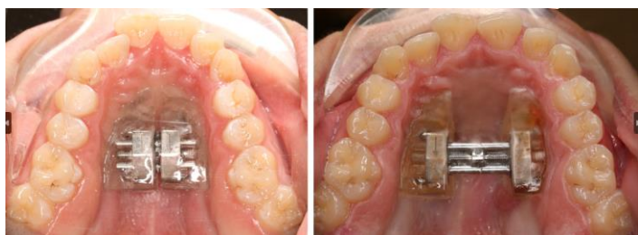
Figure 4. RME appliance applied to the patient's mouth.