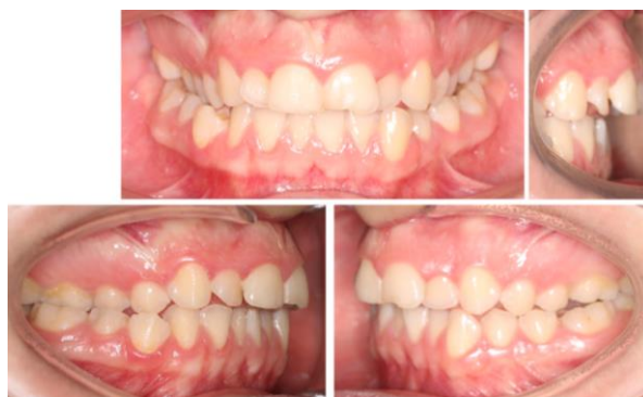
Figure 1. Initial Diagnostic Records.

explained to the patient, informed consent was obtained and the treatment phase was started.