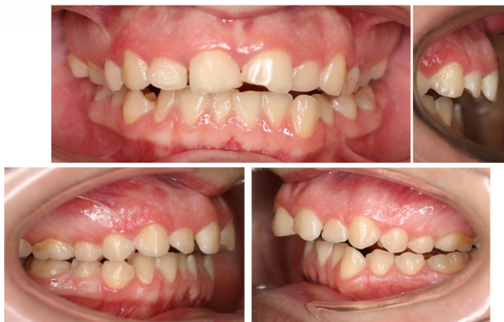
Figure 6. Intraoral photographs at the end of consolidation.