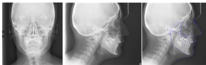
Figure 7. Cephalometric radiographs at the end of consolidation