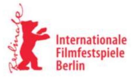
Figure 10. The Berlin International Film Festival logo design (Admindagency, 2024).

When examining the visual designs of the festival from previous years, it is observed that consistency and continuity are maintained each year. The main visual design of the festival, which has developed a common design language, was created by graphic designer Claudia Schramke. The poster design of the film festival, analyzed in figure 11, presents a clear and understandable appearance from a semantic perspective, with the bear symbol forming the focal point of the design. Dominated by fuchsia and blue tones, the festival title and date information are displayed in large, white fonts, creating a striking impression. It can be said that the fuchsia and blue tones reflect the dynamic spirit and enthusiasm of the festival. A minimalist and modern typography was used to reinforce the corporate identity of the festival. The large illustrative bear figure used on the poster creates a visual impact from a syntactic perspective, increasing interest in the festival. A modern and legible font was chosen for the festival title, adopting a straightforward expression.