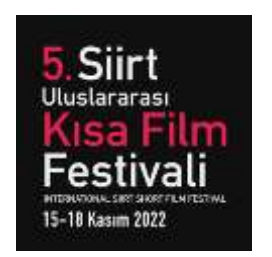
Figure 5. Logo design examples for the 5th Bingöl International Short Film Festival and the 5th Siirt International Short Film Festival. Design: Sevim Karaalioğlu.