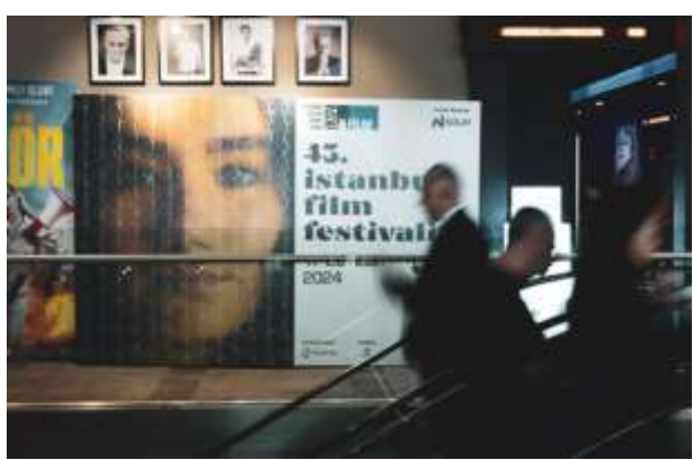
Figure 18. 43rd Istanbul Film Festival social media visuals (Instagram, 2024).