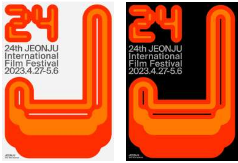
Figure 3. 24th Jeonju International Film Festival, poster designs (2023). https://eng-archive.jeonjufest.kr/db/festivalList.asp?EP NUM=24