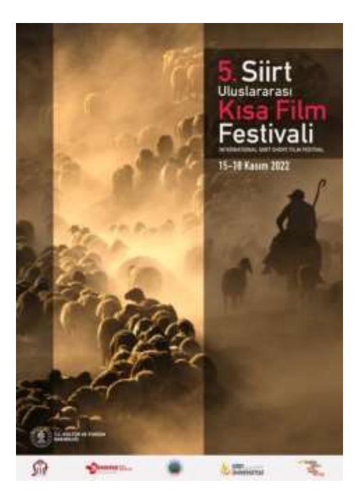
Figure 6. 5th Siirt International Short Film Festival poster designs. Poster design: Sevim Karaalioğlu (2022).

Themes determined in festivals and the design applications developed accordingly can create a striking impact. For instance, the FilmOn Film Festival, held in Poland, is a festival that focuses on allowing individuals with disabilities to express their emotions through film. When examining the festival's logo design, a strong festival identity has been created through the use of colors, patterns, and textures in each letter. In the festival posters that stand out with the slogan 'Film Festival for People with Disabilities' (Figure 7), a captivating design language has been developed using themes such as challenges, magic, feelings, adventure, community, and nature (Admind, 2022).