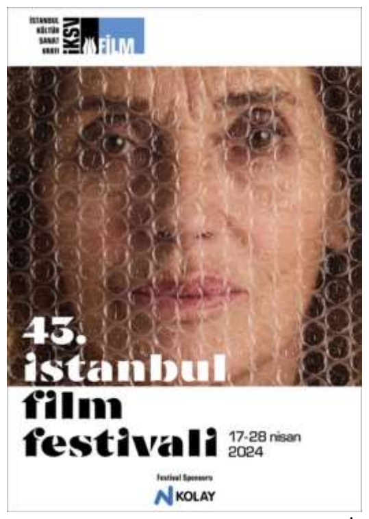
Figure 17. 43rd Istanbul Film Festival poster design (İKSV, 2024).

Bubble wrap is known as a material used to protect delicate, sensitive, and valuable items from damage. In this context, a campaign idea was developed in the festival's visual designs with the underlying message of protecting, embracing, and enveloping the festival, film art, its workers, and its audience. The poster design, inspired by this concept, features a large photograph to establish a distinct visual hierarchy. From a syntactic perspective, the choice of an aesthetic and readable font, along with the balanced unity of black-and-white colors, creates a cohesive design. It is noteworthy that the information on the poster is arranged hierarchically according to its importance.