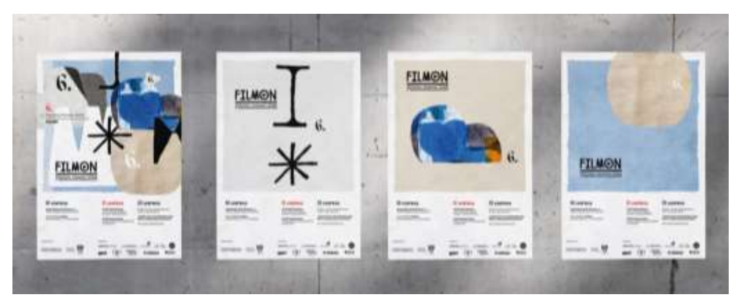
Figure 7. Filmon Film Festival poster designs (Admindagency, 2022)

Themes determined in festivals and the design applications developed accordingly can create a striking impact. For instance, the FilmOn Film Festival, held in Poland, is a festival that focuses on allowing individuals with disabilities to express their emotions through film. When examining the festival's logo design, a strong festival identity has been created through the use of colors, patterns, and textures in each letter. In the festival posters that stand out with the slogan 'Film Festival for People with Disabilities' (Figure 7), a captivating design language has been developed using themes such as challenges, magic, feelings, adventure, community, and nature (Admind, 2022).