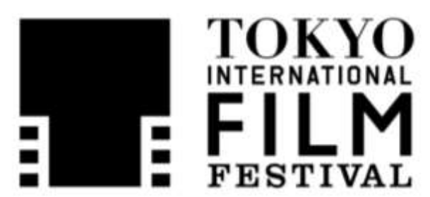
Figure 1. Tokyo International Film Festival, logo design (TFWSA, 2023).

theme of 'transcending boundaries' was used. Designer Junko Koshino presented an intriguing image with a figure of a woman advancing against the wind, featuring a motif from one of the bird paintings of the famous Edo period painter Ito Jakuchu (Figure 2) (TIFF, 2021). In the design, the use of cultural indicators and the striking use of yellow on a dark background stand out. The balance established between typography and visual elements provides an effective and elegant unity, successfully reflecting the atmosphere of the festival.