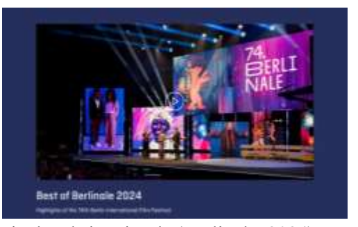
Figure 13. 74th Berlin International Film Festival website visuals (Berlinale, 2024).

In the promotional activities of festivals, souvenirs stand out as an important element of corporate identity. Products that participants can keep as memorabilia and use in their daily lives are significant for the sustainability and promotion of the event. When examining the product design of the 74th Berlin International Film Festival (Figure 14), it is observed that these products successfully reflect the festival's visual identity and make the festival more visible to a wider audience through portable items. The promotional products, developed based on the main visuals and colors of the festival, are pragmatically functional. The button example in figure 15, designed with the slogan 'Films Unite, Hate Divides', carries a powerful meaning and conveys a striking message. This graphic product is also designed in accordance with the festival's main visual identity. When evaluating the corporate identity of the 74th Berlin International Film Festival, it is evident that a unified design language has been established through graphic approaches, successfully combining design elements such as color,