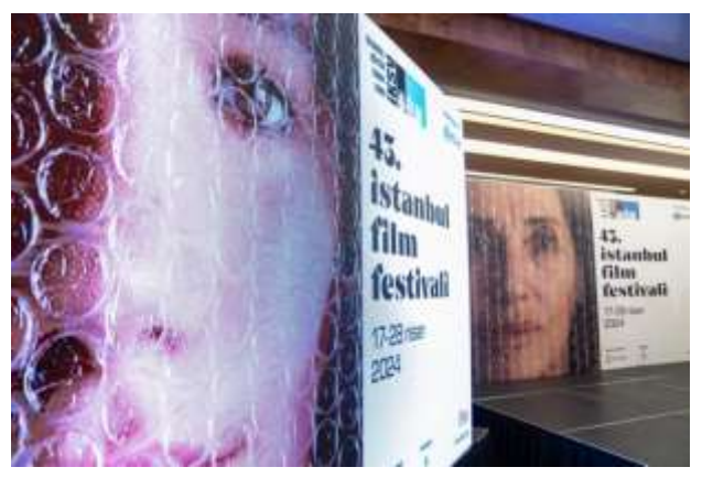
Figure 19. 43rd Istanbul Film Festival visual design applications (Keskin, 2024).

The manifesto of the highly effective festival promotional film was shared by Festival Director Kerem Ayan as follows: "Let's protect ourselves, our minds, our ideas, our memories, our laughter, our tears, our similarities, our differences, our loved ones, our gains, our losses… Let's embrace each other, films, and the festival" (Ayan, p. 14). When analyzing the content of the promotional film on a semantic level, a strong emphasis on the streets of Beyoğlu, where the festival was born, stands out (Figure 20). The symbolic representation of Beyoğlu's historical and cultural layers within the narrative structure of the festival reinforces the semantic richness of the film.