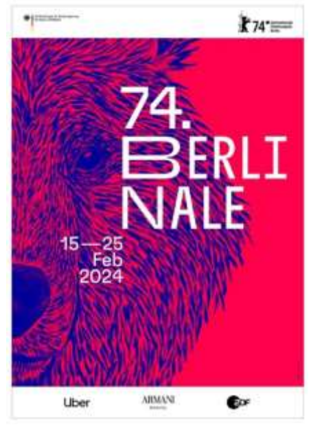
Figure 11. 74th Berlin International Film Festival poster design (Abusdecine, 2024).

When examining the visual designs of the festival from previous years, it is observed that consistency and continuity are maintained each year. The main visual design of the festival, which has developed a common design language, was created by graphic designer Claudia Schramke. The poster design of the film festival, analyzed in figure 11, presents a clear and understandable appearance from a semantic perspective, with the bear symbol forming the focal point of the design. Dominated by fuchsia and blue tones, the festival title and date information are displayed in large, white fonts, creating a striking impression. It can be said that the fuchsia and blue tones reflect the dynamic spirit and enthusiasm of the festival. A minimalist and modern typography was used to reinforce the corporate identity of the festival. The large illustrative bear figure used on the poster creates a visual impact from a syntactic perspective, increasing interest in the festival. A modern and legible font was chosen for the festival title, adopting a straightforward expression.