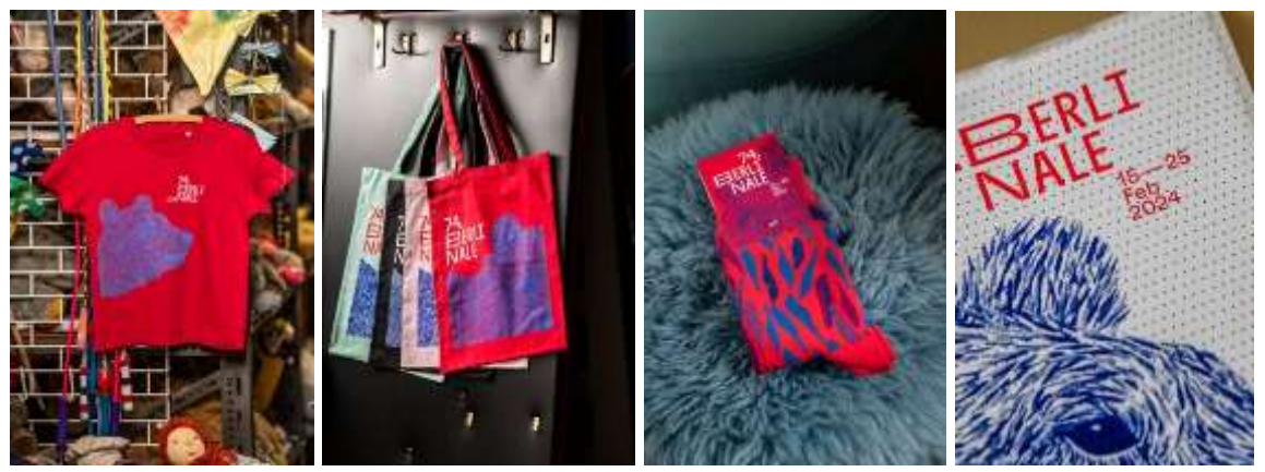
Figure 14. 74th Berlin International Film Festival promotional products (Berlinale, 2024).

typography, visual impact, texture, form, and content harmony. In this respect, it can be considered a successful example among film festivals.