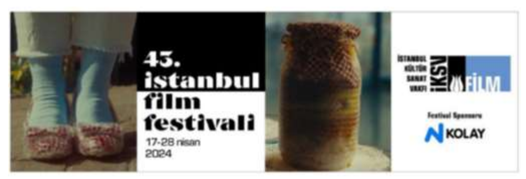
Figure 20. 43rd Istanbul Film Festival, promotional video (Erduğan, 2024).

This can be seen as a metaphorical narrative that is integrated with the identity of the festival and carries a certain aesthetic value. The use of bubble wrap highlights the experiential aspect of the festival while aiming to create a tactile memory for the viewer. This work, which ensures semantic integrity, also stands out as a successful example of a festival film when examined in terms of design elements. The combination of fundamental design elements such as color, typography, visual impact, texture, and form with the content strengthens both the aesthetic and functional aspects of the promotional film. In conclusion, the promotional film successfully draws the audience into the cultural texture of Beyoğlu and the aesthetic world of the festival.