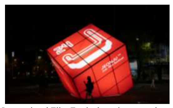
Figure 4. 24th Jeonju International Film Festival, environmental graphics (Medium, 2023).

It has been previously emphasized that film festivals play a significant role in promoting local regions and gaining international recognition. For instance, the 5th Bingöl International Short Film Festival, supported by the General Directorate of Cinema of the Ministry of Culture and Tourism, opens its doors to art lovers by hosting new works that meet Turkey's and Anatolia's need for art, continuing to enhance the cultural value of film festivals (BKFF, 2023). From a visual design perspective, the festival's logo adopts a typographic expression, using a highly legible font (Figure 5). The festival's color palette consists of yellow and black tones, with yellow reflecting the warm atmosphere and positive energy of the festival. Similarly, the 5th Siirt International Short Film Festival, also supported by the General Directorate of Cinema of the Ministry of Culture and Tourism, is among the significant festivals that contribute to the development of the country's cinema culture and hold cultural importance (SKFF, 2022). The festival's logo design achieves unity through typographic arrangement, creating a vibrant effect with colors.