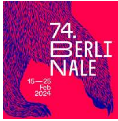
Figure 12. 74th Berlin International Film Festival social media design (Instagram, 2024).

The visuals of the festival's website, which provide informative content for the promotion, announcement, and application processes (Figure 13), are designed in harmony with the visual design language of the festival. By utilizing the complementary power of different colors, the joy and emotions of the festival are effectively conveyed. The bear symbol, representing Berlin, is presented in various formal shapes and animated graphics in the design applications, creating an interactive experience for users. Especially, animated graphics engage festival participants more actively in the process, making the experience more interactive. In this context, it can be concluded that animated visuals are more functional than static ones.