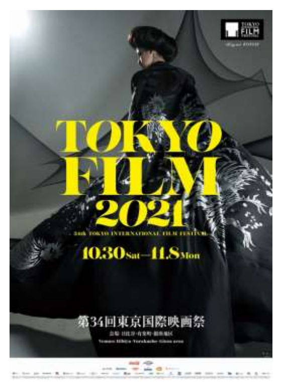
Figure 2. Tokyo 2021 International Film Festival, poster design (Tiff-Jp, 2021).

The Jeonju International Film Festival, held in Jeonju, South Korea, was established in 2000 and offers limitless possibilities and experiences beyond a film festival with its innovative vision (JEONJU IFF, 2024). The poster designs for the 24th Jeonju International Film Festival, which stands out with the slogan 'Cinemas beyond the frame', use a minimalist expression (Figure 3). In these designs, where typographic elements are prominent, a typeface reflecting the rhythm of the festival was used. Inspired by the slogan 'Cinemas beyond the frame', a sense of unity was created between the graphic forms designed in orange and red tones and the typography. The use of red and orange emphasizes the dynamic, warm, and joyful atmosphere of the festival, creating an impressive visual effect. The cube-shaped environmental graphic example positioned outdoors (Figure 4) creates a dynamic effect, offering a physical display that highlights the identity of the festival.