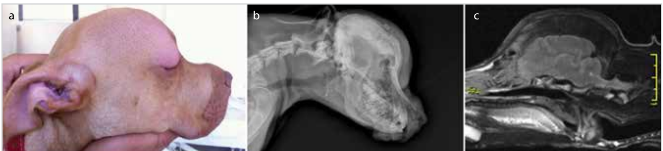
Figure 1. a-c. (a) Calvarial swelling with hyperemia on the forehead and edema on the right upper eyelid. Firm asymmetrical swelling on the frontal and parietal bones of the skull. (b) Lateral radiograph of the skull. Diffuse sclerotic areas, cortical thickening, loss of trabecular structure and irregular periosteal reaction on the dorsal region of the calvaria. (c) Sagittal T2 weighted MR imaging scan of the skull. An enlarged diploe due to regular thickening of the trabecular bone tissue

This condition was reported only in juvenile dogs and whether or not gender affects susceptibility to the disease is still a matter of debate (Pastor et al., 2000; McConnell et al., 2006; Mathes et al., 2012). In the presented case, the disease was encountered in a 4-month-old female Pit Bull. Clinical signs of the disease