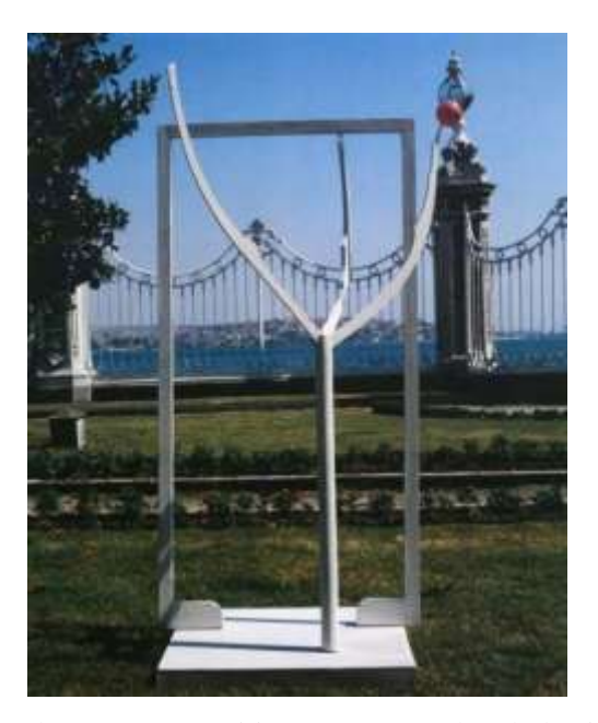
Picture 5. Füsun Onur, Abstract Composition, 1971, wood and plastic ball, 194x89x65 cm., Istanbul State Art and Sculpture Museum.

An important turning point among Onur's works is her 1974 work titled Nude (Picture 6). This work was prepared for the Nude Exhibition the Turkish Sculptors Association<sup>3</sup> opened in protest against the removal of Gürdal Duyar's Beautiful Istanbul <sup>4</sup> for depicting Istanbul as a nude female figure. It was one of the twenty sculptures commissioned for public spaces to celebrate the 50th anniversary of the Republic. Nude , which consists of the torso of a nude doll in the pose of a pinup model, cut in three places and placed in a mirrored box, resembles the dolls that were placed as decorations on public transport vehicles such as minibuses in those years as " sex symbols " which were seen by the public. Compared to Gürdal Duyar's Beautiful Istanbul , with its exposed breasts and pinup model pose, Nude evokes sexuality in a real sense and is a work that shows how an immoral figure should be. The figure, seen from every angle through mirrors, further reinforces this sexualised image. The work is a protest against the moralistic attitude of the current government. It is also a significant early attempt by the artist to use ready-made objects as an art piece completely.