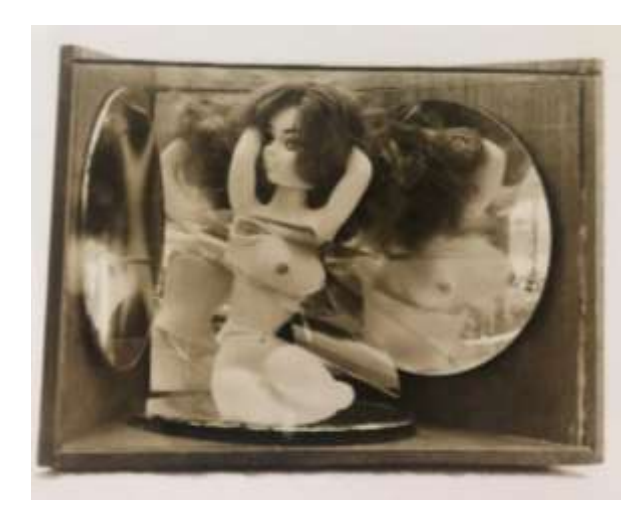
Picture 6. Füsun Onur, Nude, 1974, wood, glass, mirrors, plastic doll, 30x20x15 cm. (IKSV).

An important turning point among Onur's works is her 1974 work titled Nude (Picture 6). This work was prepared for the Nude Exhibition the Turkish Sculptors Association<sup>3</sup> opened in protest against the removal of Gürdal Duyar's Beautiful Istanbul <sup>4</sup> for depicting Istanbul as a nude female figure. It was one of the twenty sculptures commissioned for public spaces to celebrate the 50th anniversary of the Republic. Nude , which consists of the torso of a nude doll in the pose of a pinup model, cut in three places and placed in a mirrored box, resembles the dolls that were placed as decorations on public transport vehicles such as minibuses in those years as " sex symbols " which were seen by the public. Compared to Gürdal Duyar's Beautiful Istanbul , with its exposed breasts and pinup model pose, Nude evokes sexuality in a real sense and is a work that shows how an immoral figure should be. The figure, seen from every angle through mirrors, further reinforces this sexualised image. The work is a protest against the moralistic attitude of the current government. It is also a significant early attempt by the artist to use ready-made objects as an art piece completely.