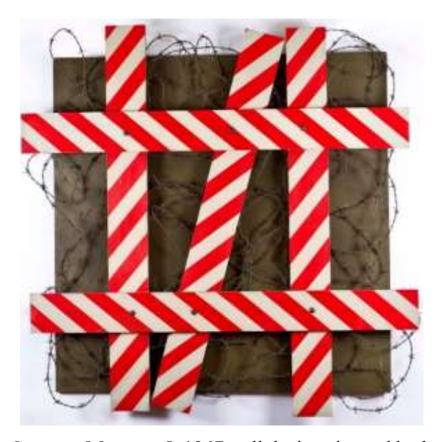
Picture 2. Altan Gürman, Montage 5, 1967, cellulosic paint and barbed wire on wood, 140x140x9 cm. (Google Arts & Culture).

With the Montage Series , in addition to not signing the works, he stopped using the expressionist/painterly features of colour (Picture 2). He opened the issues of two-dimensionality and the boundaries of the frame, which were essential topics of discussion at the time. He also started to use ready-made industrial materials with this series. These approaches can be compared to the innovations of Rauschenberg. However, Gürman's uniqueness lies in his use of symbols (for conceptual criticism) that remind the viewer of the military, which was always considered the symbol of sovereignty and authority in Turkiye (Koyunoğlu, 2018, p. 297).