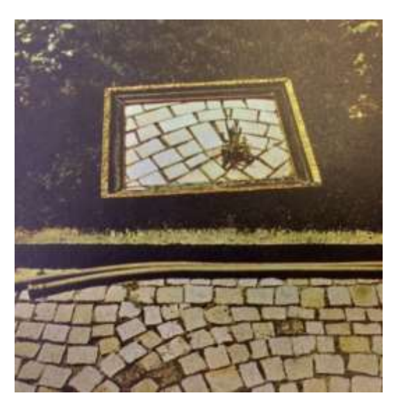
Picture 8. Füsun Onur, Frame, Stone, Earth, Flower, 1977, frame, stone, earth, flower, 85x100 cm. (Erzen, 1982, p. 10).

The fact that the work was accepted to a well-known exhibition is evidence that there were artists in Turkiye who were accepted as postmodern artists instead of modern artists, who produced works that broke free from traditional artistic patterns and began infiltrating into everyday life.