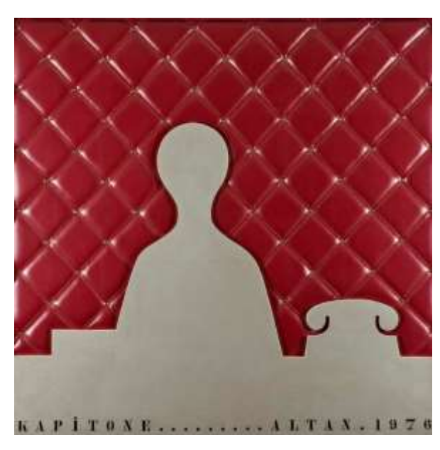
Picture 3. Altan Gürman, Padded, 1976, artificial leather and cellulosic paint on wood, 120x123 cm. (Arter).

"In the face of this work, the viewer is looking at a painting that raises a particular subject but, on the other hand, is also surrounded by a space. Beyond being a representation, the padded back wall stands like a quilted back wall in the real sense within the space the viewer is in; thus, the viewer turns into a body that shares a common space with the painting rather than looking at it from the outside. In this respect, it is natural that Gürman hung this painting behind his desk in his room at the Academy! The painting arouses the viewer's desire to turn around and look at it." (Antmen, 2002, p. 204)