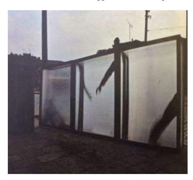
Picture 7. Füsun Onur, Untitled (Life Behind the Walls), 1975, plexiglass, 200x385 cm. (Erzen, 1982, p. 10).

The work, which the artist exhibited as Untitled ( Life Behind the Walls ) in the Taksim Art Gallery in 1975, is another important cornerstone in the transformation of Onur's art (Picture 7). The three-panelled wall made of matte plexiglass questions the dialogue between the world of art and our world by giving the illusion of movement behind it and now appears as an example of conceptual art.