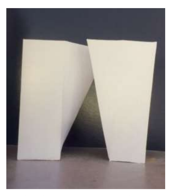
Picture 4. Füsun Onur, Dual Sculpture, 1969, wooden poles and canvas cloth, 320x200x80 cm., artist's collection (Koçak, 2008, p. 333).

The work's need for phenomenological experience is particularly evident in Onur's Dual Sculpture , dated 1969 (and in her other works of the 1970s) (Picture 4). Although the work is based on the relationship between space and the subject of fullness and emptiness, which was presented in geometric abstract form, these two forms standing against the wall without a pedestal call the viewer to interact with the work, to calculate and correct the balance of the sculpture and to combine these two forms in their mind.