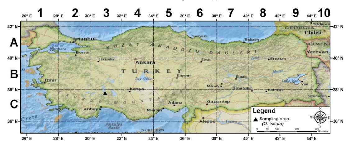
Figure 1. The location of the sampling area of the O. isaura species in the grid system of Davis (1984)

To determine the climatic characteristics of the sampling area, data from the CHELSA version 2.1 database were used. According to the coordinates of the sampling area, 19 bioclimatic variables were obtained from the CHELSA database (Karger et al., 2017).