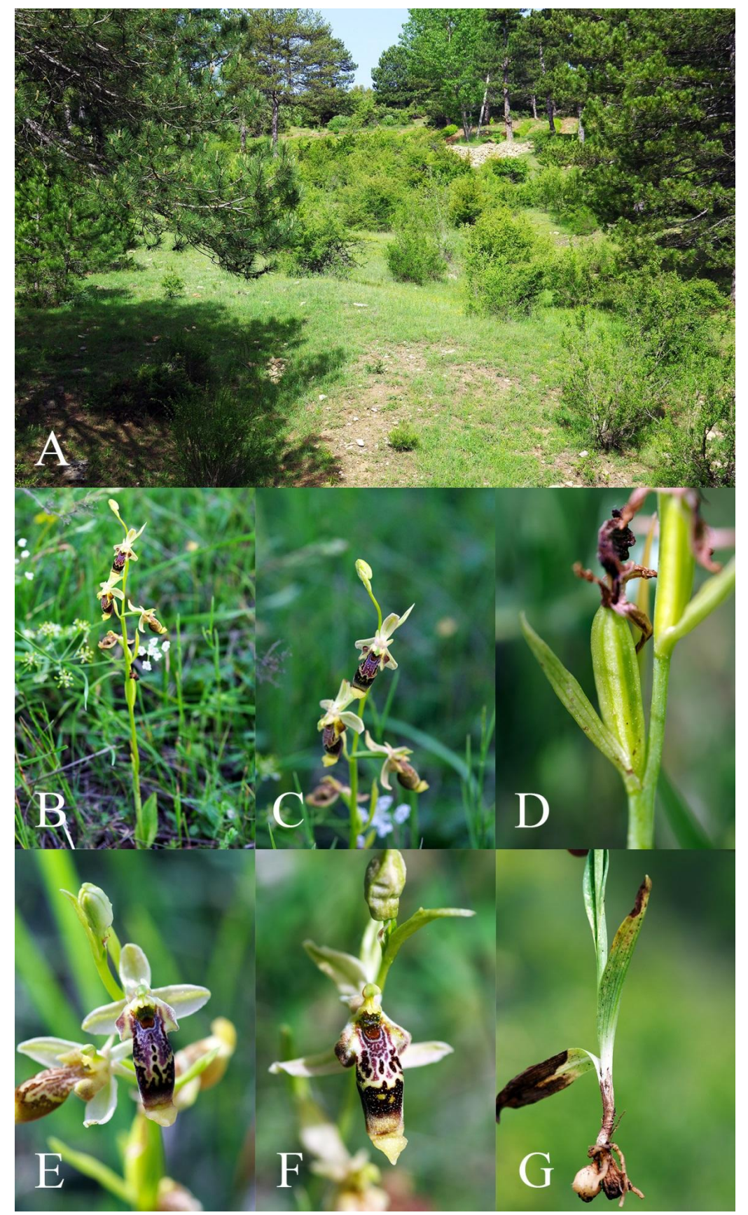
Figure 2. A) New distribution area, B and C) General appearance D) Fruit E) Front and side view of the flower G) Tuber