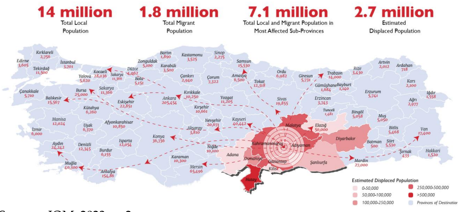
Figure 2. Region Affected by the Earthquake in the South of Turkey and the Most Favoured Place, Ankara, Post-Earthquake, in the Centre of Turkey

thousands of people become homeless in a very short time timeframe. Figure 2 below illustrates both the location of disaster area and its extent. It also shows that Ankara was the preferred destination, rather than the surrounding areas, for the 205,454 earthquake victims, who chose to relocate there instead of to closer or larger cities with more employment- and location-based opportunities.