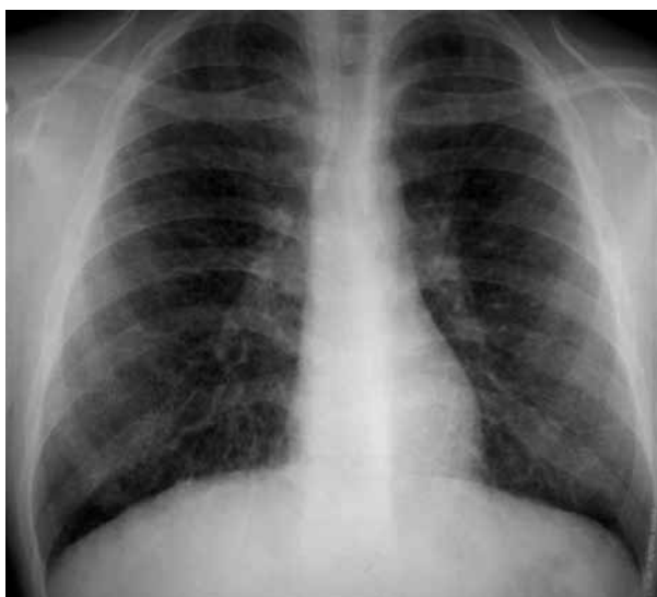
Fig. 1. Chest radiography: Diffuse micronodular and interstitial-appearing infiltrates and small cystic air spaces.

The patient was intended to be prepared for fiberoptic bronchoscopy but the task could not be achieved because he was unable to stay at least three hours without drinking water. Endocrinology Department was asked for a magnetic resonance imaging of hypophysis which did not show T1 intensity of neurohypophysis that is normally located on the posterior of hypophysis. Fluid deprivation test and desmopressin stimulation test were performed. The patient responded with decreased urine output and increased urine osmolality. Pituitary hormones were normal. He was diagnosed to have central diabetes insipidus and his treatment with vasopressin was started. While waiting for the results of the tests, the patient developed acute right-sided chest pain requiring urgent evaluation. Physical examination revealed tachypnea and decreased respiratory sounds over the right side of the lung. He had a right-sided spontaneous pneumothorax. After insertion of the chest