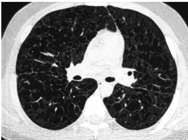
Fig. 2. High resolution computed tomography scan showing bilaterally uniform thin-walled cysts 1-1.5 cm in diameter.

The patient was intended to be prepared for fiberoptic bronchoscopy but the task could not be achieved because he was unable to stay at least three hours without drinking water. Endocrinology Department was asked for a magnetic resonance imaging of hypophysis which did not show T1 intensity of neurohypophysis that is normally located on the posterior of hypophysis. Fluid deprivation test and desmopressin stimulation test were performed. The patient responded with decreased urine output and increased urine osmolality. Pituitary hormones were normal. He was diagnosed to have central diabetes insipidus and his treatment with vasopressin was started. While waiting for the results of the tests, the patient developed acute right-sided chest pain requiring urgent evaluation. Physical examination revealed tachypnea and decreased respiratory sounds over the right side of the lung. He had a right-sided spontaneous pneumothorax. After insertion of the chest