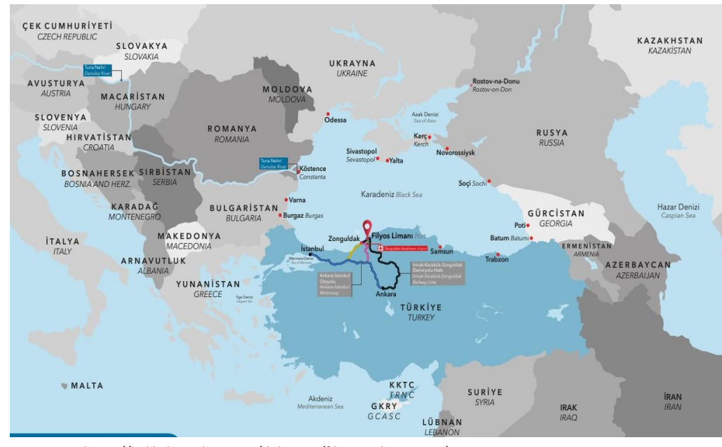
Figure 1: Location of the Filyos Valley Project (FVP)