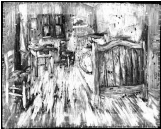
Image 4. X-ray image of the first version of the van Gogh's painting

Unfortunately, the first picture (72.4 cm x 91.3 cm) had suffered some moisture damage and he had sent it to his brother in Paris for repair. A year later he had painted another one, slightly larger (73.6cm x 92.3 cm), and almost immediately after, the third one, somewhat smaller (56.5cm x 74 cm), as a gift to his mother and sister. From the correspondence with his brother it is clear that the smallest was painted the last (Letter 806), but for the longest time it was not clear which one had been painted the first. Only with the help of modern technology and information about damage gained from the letter, experts have managed to establish that the first one is today in the Van Gogh Museum in Amsterdam, the second in the Art Institute of Chicago, and the third, the smallest, in the Musée d'Orsay in Paris.