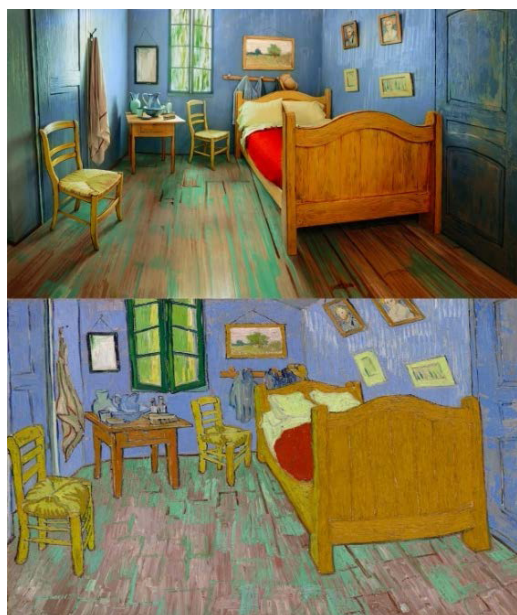
Image 6. Room for rent above and the 2nd version of The Bedroom below

However, in order to draw attention of the general public, in consultation with experts from one of the leading global advertising agencies, Leo Burnett, the Art Institute of Chicago had decided to make two replicas of the van Gogh's painting The Bedroom – one in a modern apartment located near the Institute and the other one in the Institute itself, comprising the integral part of this exhibition. The Institute put the first room up for rent on the popular home-sharing website Airbnb for only $ 10 per night with complimentary two tickets for the exhibition (Shropshire, 2016. February 11). In this way, the interested public could not only see the painting of the room on the second floor of Yellow House in Arles where van Gogh lived at the end of the 19th century, but also spend the night in such a room.