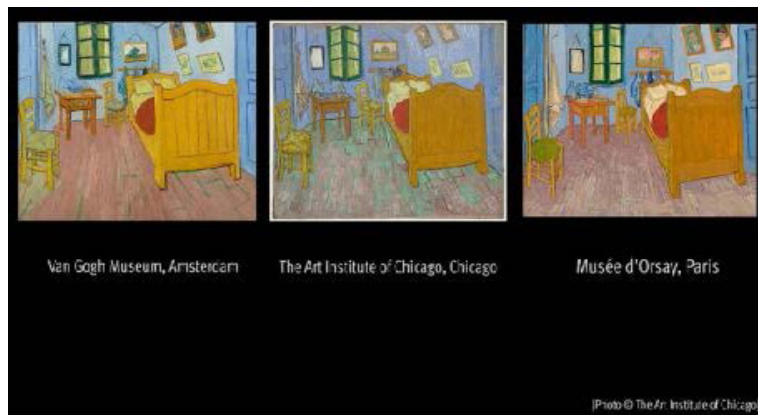
Image 3. All three versions of the picture The Bedroom

"This time it's simply my bedroom, but the color has to do the job here... In short, looking at the painting should rest the mind, or rather, the imagination. The walls are of a pale violet. The floor — is of red tiles. The bedstead and the chairs are fresh butter yellow. The sheet and the pillows very bright lemon green. The blanket scarlet red. The window green. The dressing table orange, the basin blue. The doors lilac. And that's all... Portraits on the wall, and a mirror and a hand-towel and some clothes. The frame — as there's no white in the painting — will be white... The shadows and cast shadows are removed; it's colored in flat, plain tints like Japanese prints." (Van Gogh's Letter no. 705)