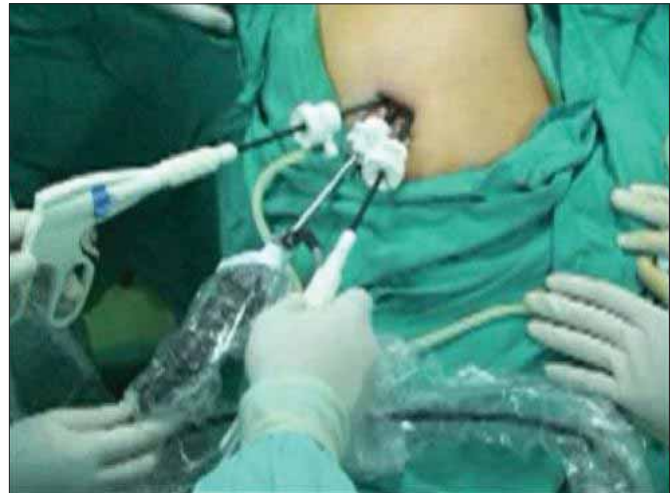
Figure 1. Transumbilical three 5 mm trocars

Although SILS practice is relatively new, it has already been applied in many surgical procedures by ambitious surgeons who always look for the best option. Many procedures such as