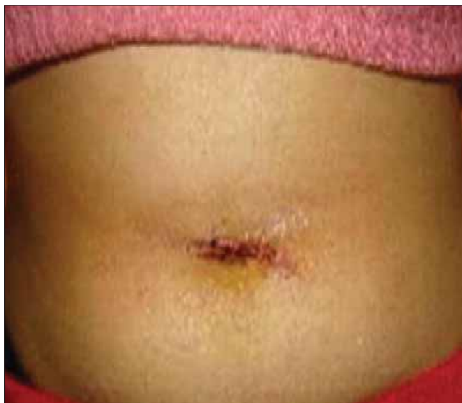
Figure 4. View of the umbilicus postoperatively