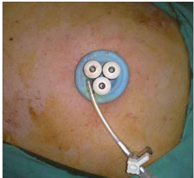
Figure 2. Special SILS trocar