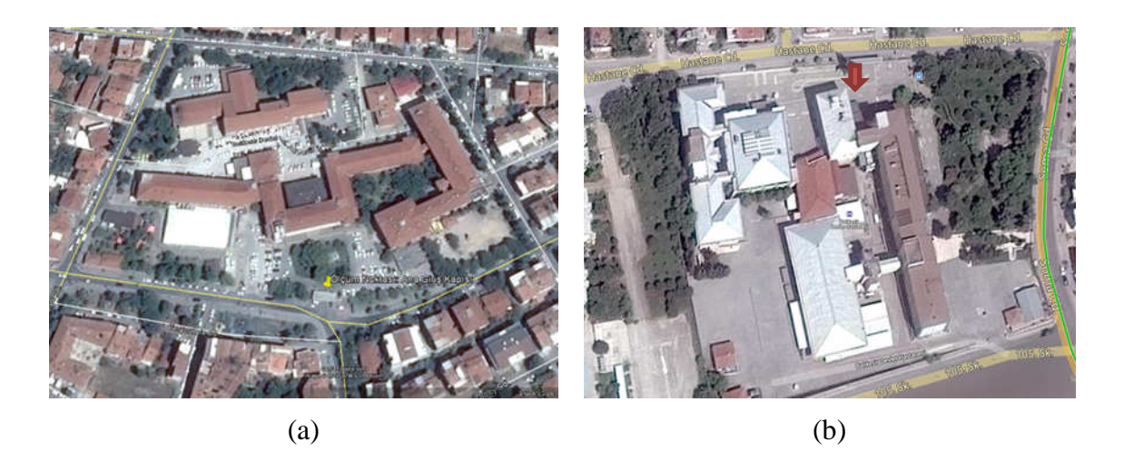
Figure 1. Balikesir state hospital (a) and Atatürk state hospital (b).