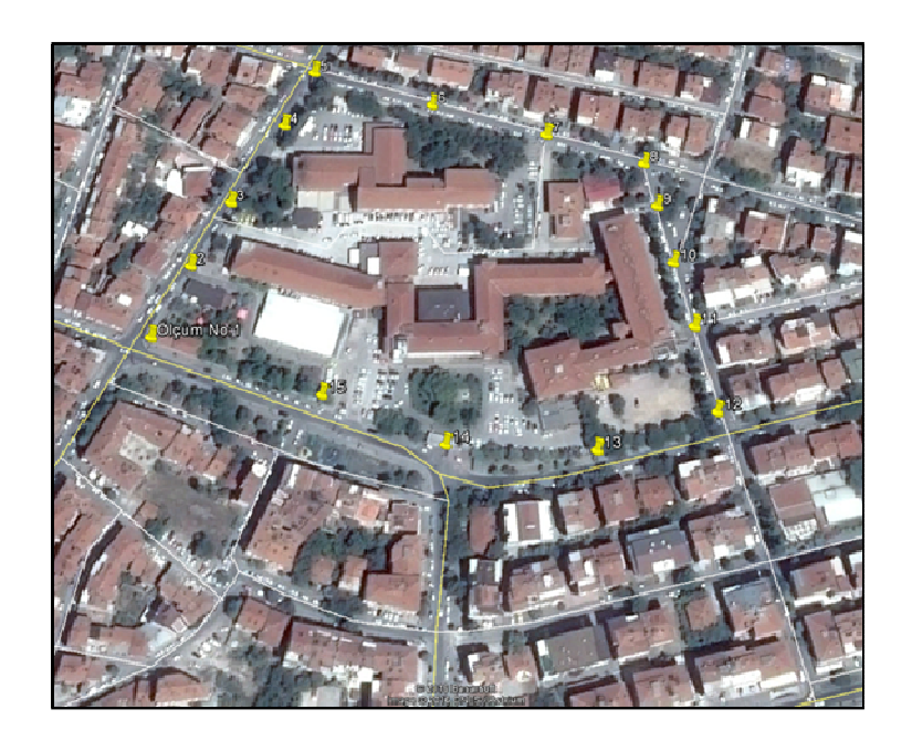
Figure 2. Measurement points at BSH (Balikesir state hospital).

In the second part of the study, environmental noise measurements were conducted at BSH (Balikesir State Hospital), where local traffic activities are more intense, to ensure the validity of the modeling results. In order to determine noise levels that the BSH may be exposed, a total of 15 measurement points are selected around the hospital (Figure. 2).