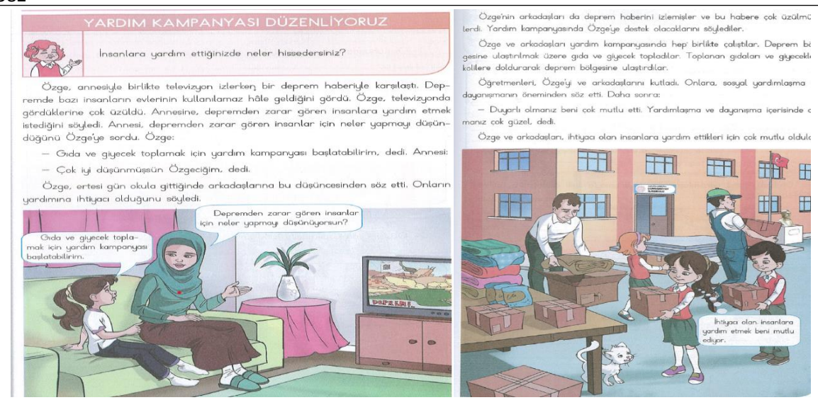
Visual 4. We are organizing a charity campaign (Judgment formation)