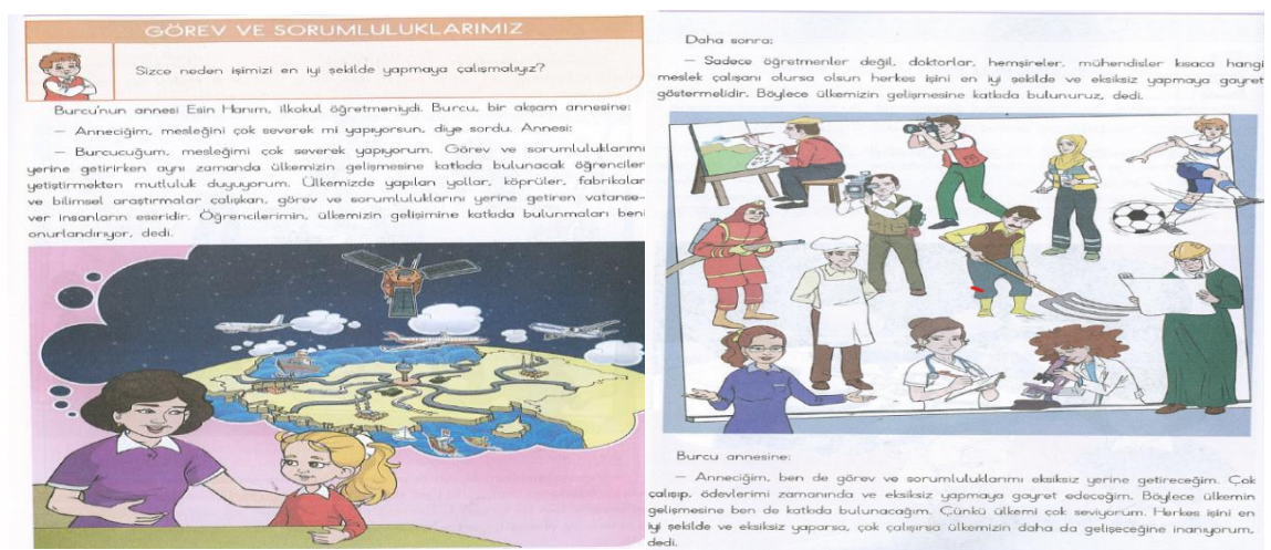
Visual 3. Our duties and responsibilities (Based on criteria/measure)

Being Criterion/Measure Based: The text "Our Duties and Responsibilities" in the "Life in our country" unit can be used as an example for this category. The question "Why do you think we should try to do our job in the best way?" in the text and the teacher's statement "If everyone does their job completely and well, our country will develop." in the process of the mother and daughter's search for an answer to this question are associated with the result of the criteria met (Visual 3).