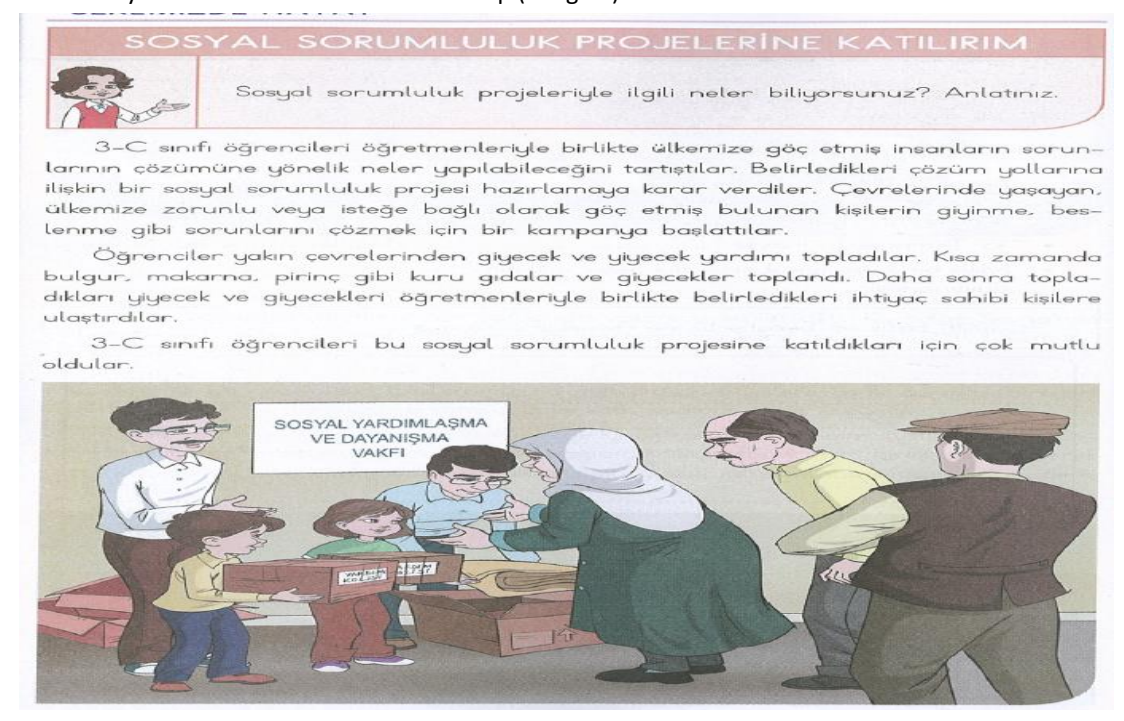
Visual 2. Participation in social responsibility projects (Sensitivity to context)

taking into account the relevant conditions" of context sensitivity. A special behavior was developed for individuals who migrated to our country and need material and moral help (Image 2).