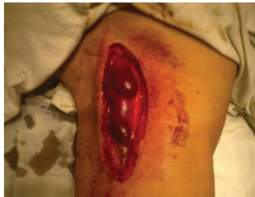
Picture 2: Aneurysm of the basilic vein