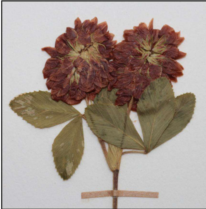
Figure 3. Trifolium aureum var. barbulatum (E 00339260).