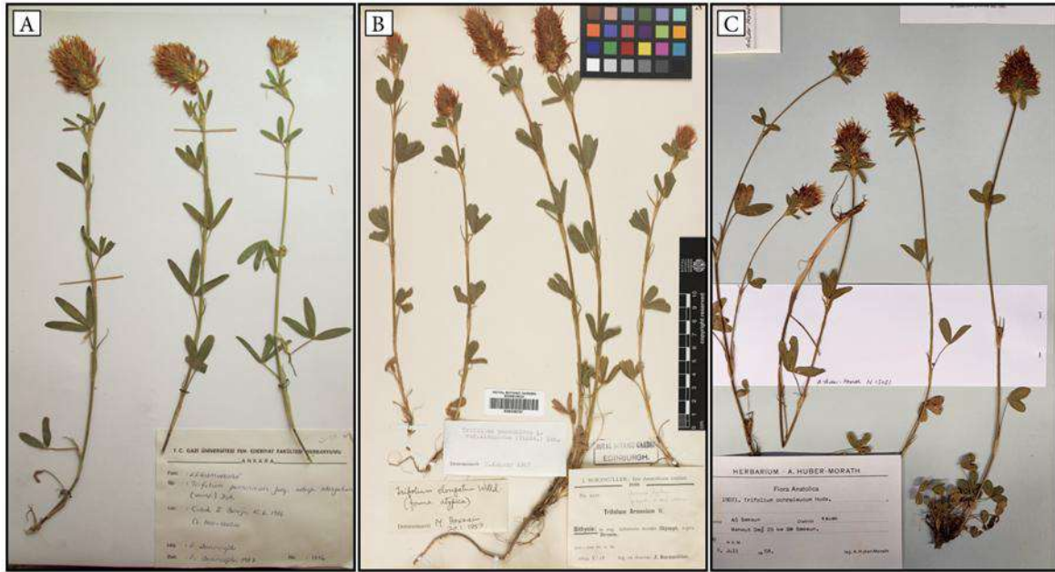
Figure 1. The general appearance of the new hybrid species and the ancestral species: A. Trifolium elongatum (GAZI 1116); B. T. x severoglui (E 00338757, type); C. T. ochroleucon (G).